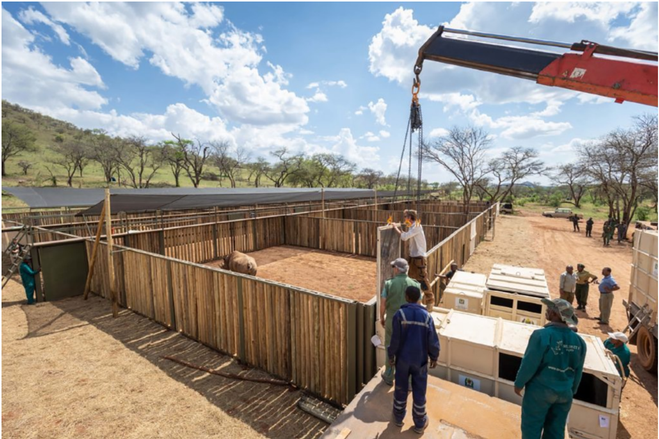
Offloading the black rhino in Tanzania.

There are many logistical and administrative tasks involved in the ultimate success of such a mammoth venture. But few people are aware of the crucial role of the rhino keepers, who put their lives on hold to care for the animals while they are in captivity.