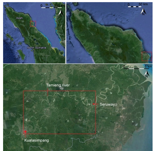
Figure 1: Approximate location of Bindjai Tamieng

the 1930’s by Van Stein Callenfels (1936) on the Malayan side of the Malacca strait and was recently re-studied by a team of Singaporean archaeologists (Tieng 2013). Most of the Sumatran shell middens of the so called “Hinai midden complex” were primarily composed of shells of the brackish bivalve mollusc Meretrix meretrix and were situated between ten and twenty kilometers from the current coast line (Edwards Mackinnon 1991). According to Brandt (1976) these sites resulted from the seasonal exploitation of estuarine resources. As sea levels only reached their current level around 5000 years ago, it is likely that many of these sites were originally situated much closer to the shoreline (Miksic 1977, Edwards Mackinnon 1991).