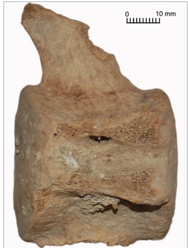
Figure 4: Caudal vertebra of a small toothed whale from Binjai Tamieng