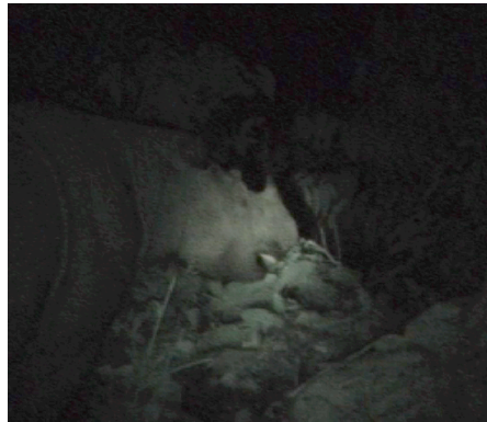
Figures 7 & 8. Rosa walked between tents and eating in the night close to the camp.