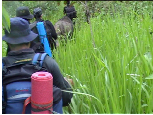
Figures 9 & 10. 16 October, Rosa eat before leaves Talang Puncak and walked together with the Team.