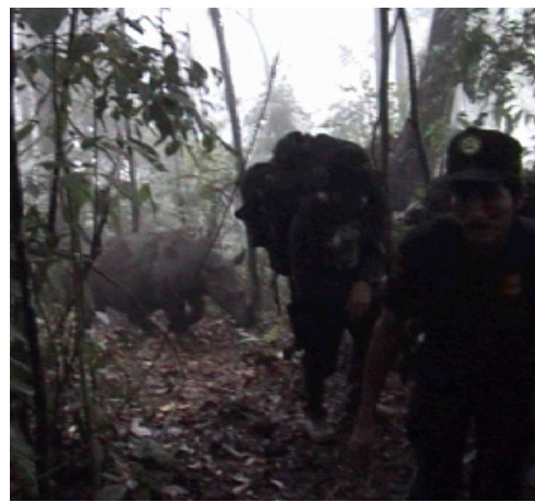
Figure 3 & 4. Day one, 13 October 2005, when The Team walk together with Rosa started climb the mountain.