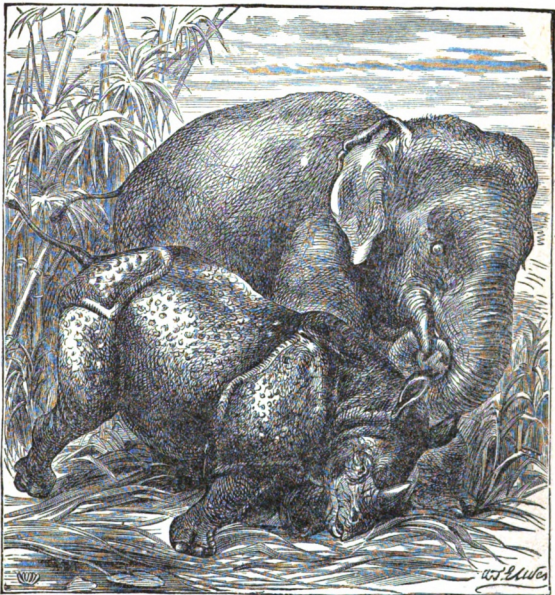
ELEPHANT AND RHINOCEROS.