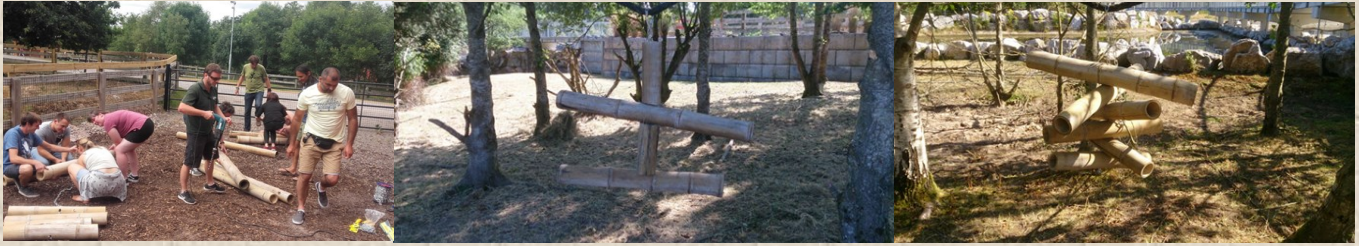
Rhino keepers hard at work on their bamboo enrichment.