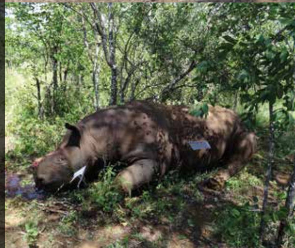
Bottom right: Poached rhino. LRT works in partnership with security personnel on anti-poaching activities