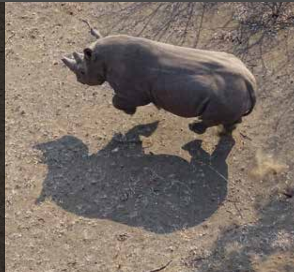
Right: LRT has just concluded rhino ops in Bubye Valley Conservancy. This image was taken from the helicopter shown below