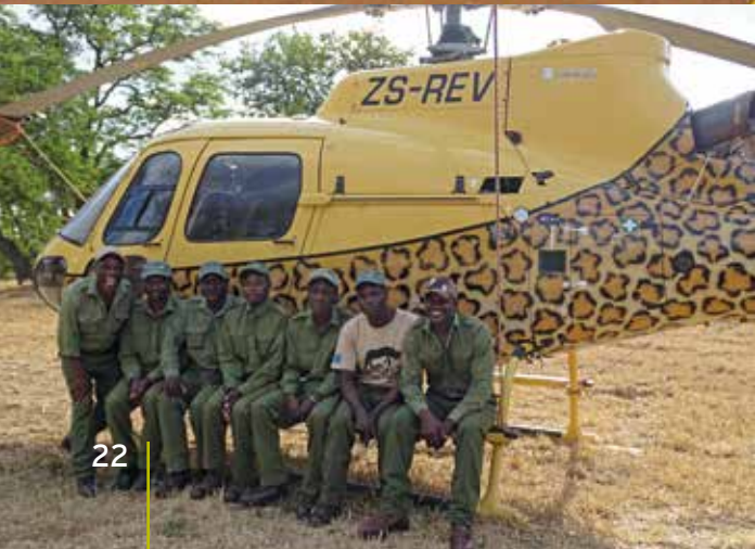
Bottom left: LRT runs annual rhino management operations to maintain 100% individual identification in the populations they monitor. This requires teamwork and skill