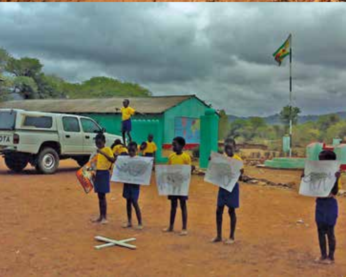
Left: LRT runs a rhino conservation awareness programme in more than 150 schools neighbouring the rhino conservancies. This includes rhino conservation materials such as the Rhino Cards, a mobile movie programme and an annual 'Rhino Prize' for rhino quiz competitions