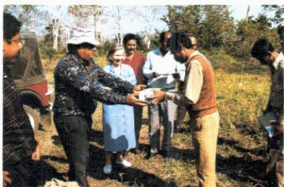
Presenting boots and jackets to the forest guard

THE PROJECTS identified on a priority basis in collaboration with the Forest Department to protect the rhino and its habitat, consist of: