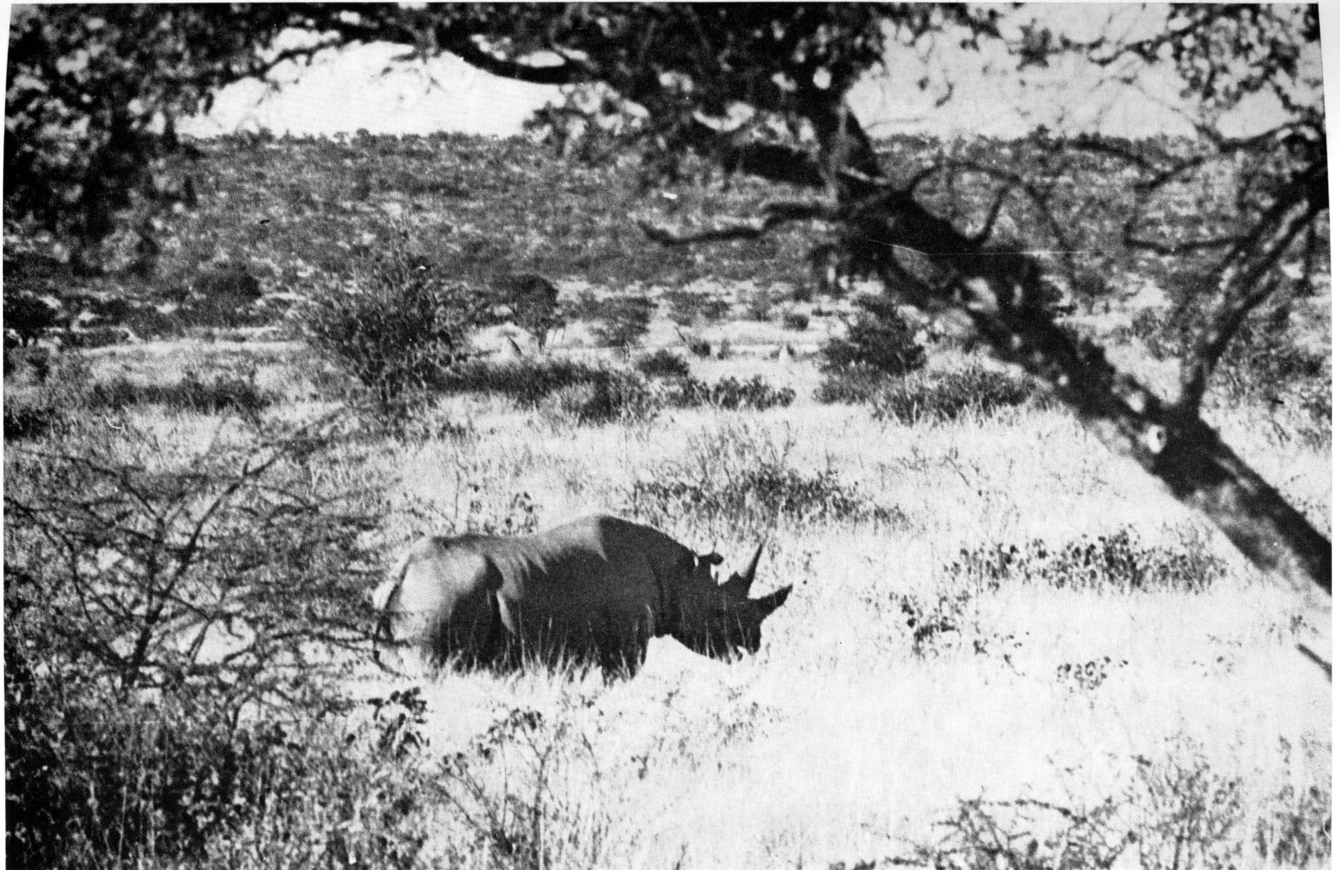
Plate 2. Female black rhinoceros in the Etosha National Park showing the two horns of nearly equal length.