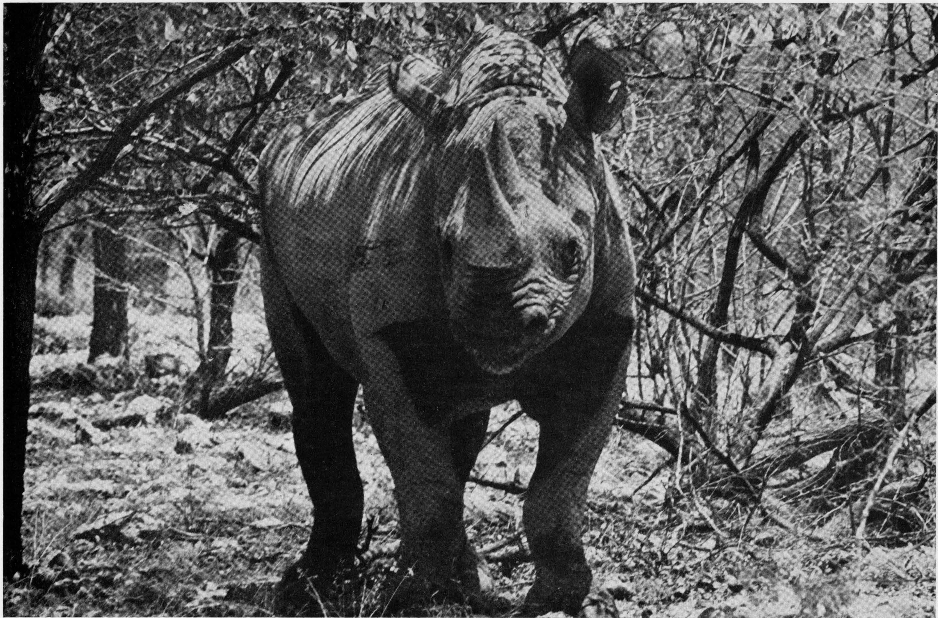
Plate 1. Black rhinoceros in a typical stance.