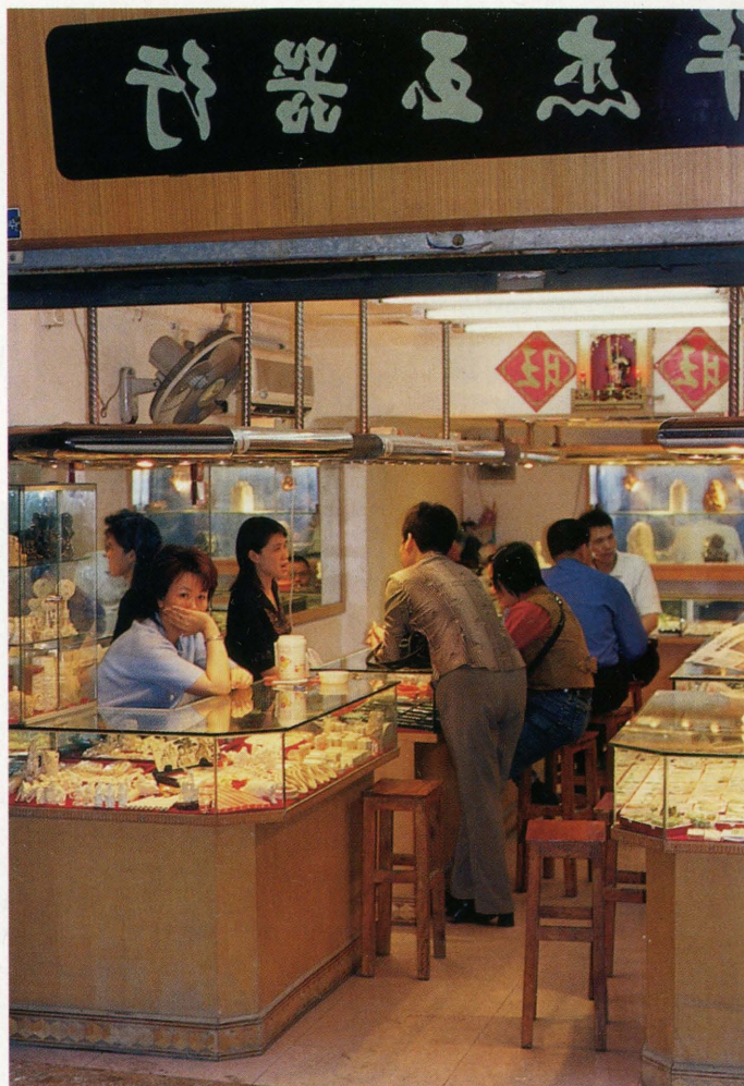
Buying power. While the West is still a major ivory market, China's nouveau riche are emerging, ominously, as increasingly important ivory consumers.