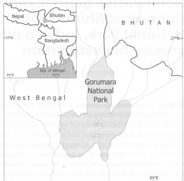
FIG. 1 Sites where samples of greater one-horned rhinoceros Rhinoceros unicornis dung were collected in Gorumara National Park, West Bengal.

Field survey and sample collection The field survey was undertaken during April 2011 by UB and PKD accompanied by the field staff of Gorumara Forest Department, to locate fresh samples of rhinoceros dung, preferably deposited no more than 24 hours prior to