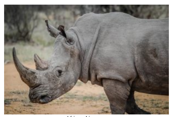
African rhinoceros

But by the Ming dynasty (1368-1644) during the height of rhinoceros horn carvings, the Chinese had established trade with Africa, giving them access to the horn of the African rhinoceros. <sup>4</sup> The African rhinoceros has two horns that are substantially larger than that of the Asian. The piece on display here is most likely carved from an African rhinoceros horn.