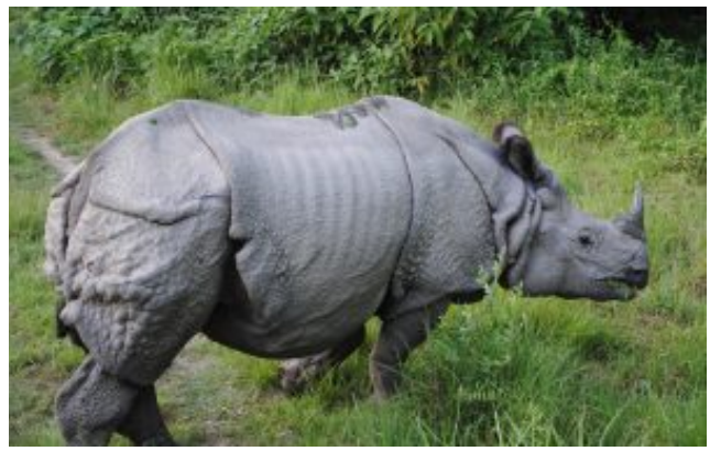
One horned Asian rhinoceros Dulal, Krish. Rhinoceros in Bardiya Nepal.

The rhinoceros used to roam the valleys of China, but by the time of the Qing dynasty (1644-1912) the rhinoceros had vanished primarily due to human predation.<sup>3</sup>