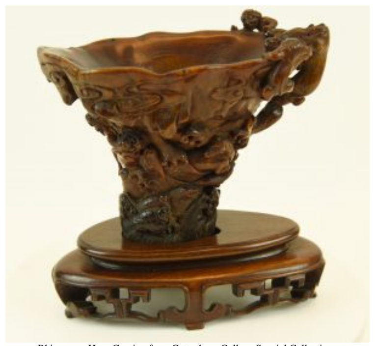
Rhinoceros Horn Carving from Gettysburg College Special Collections

Rhinoceros Horn Libation Cup, China, 1735-1799, Horn, 14.2 x 14.6 cm., Gift of John H. Hampshire, Special Collections and College Archives, Gettysburg College.