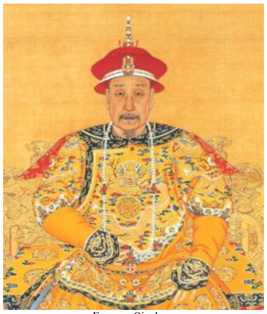
Emperor Qianlong

The horn shows animals, such as dragons and horses, surrounded by clouds and waves, resembling a mountain with the shape of the horn. In the Taoism belief system, mountains, like the one depicted on the carved horn, are the home of the immortals. This motif originated in the Han dynasty (206 BC - 220 AD).