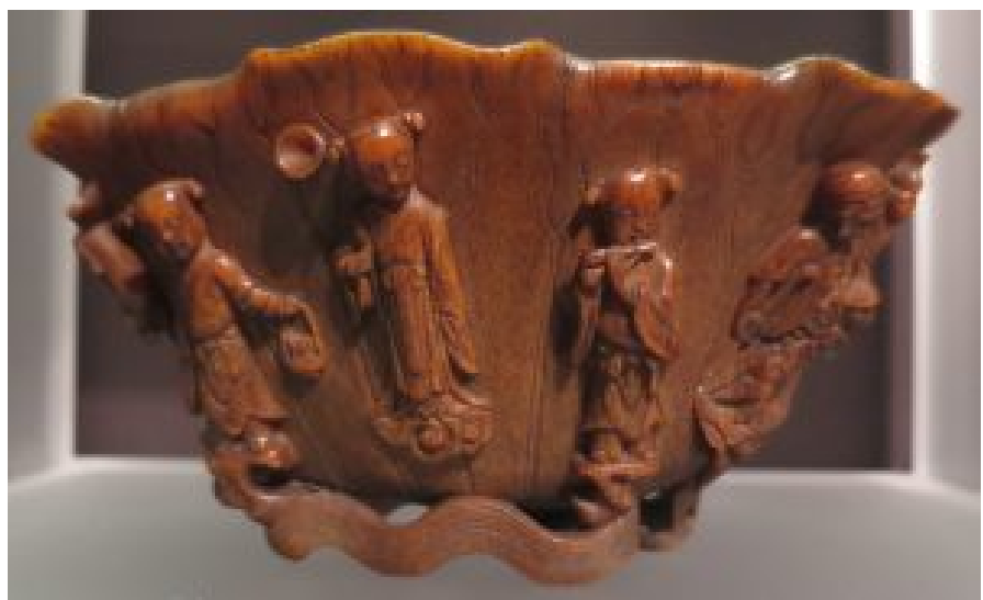
Rhinoceros horn cup with eight Daoist immortals, Qing dynasty, late 18th-19th century, Metropolitan Museum of Art

Carving of the rhinoceros horn started as early as the T'ang dynasty primarily used as sacrificial cups and as drinking containers to use during ceremonies honoring ancestors.<sup>2</sup> Later, the pieces were mostly for decorative purposes.