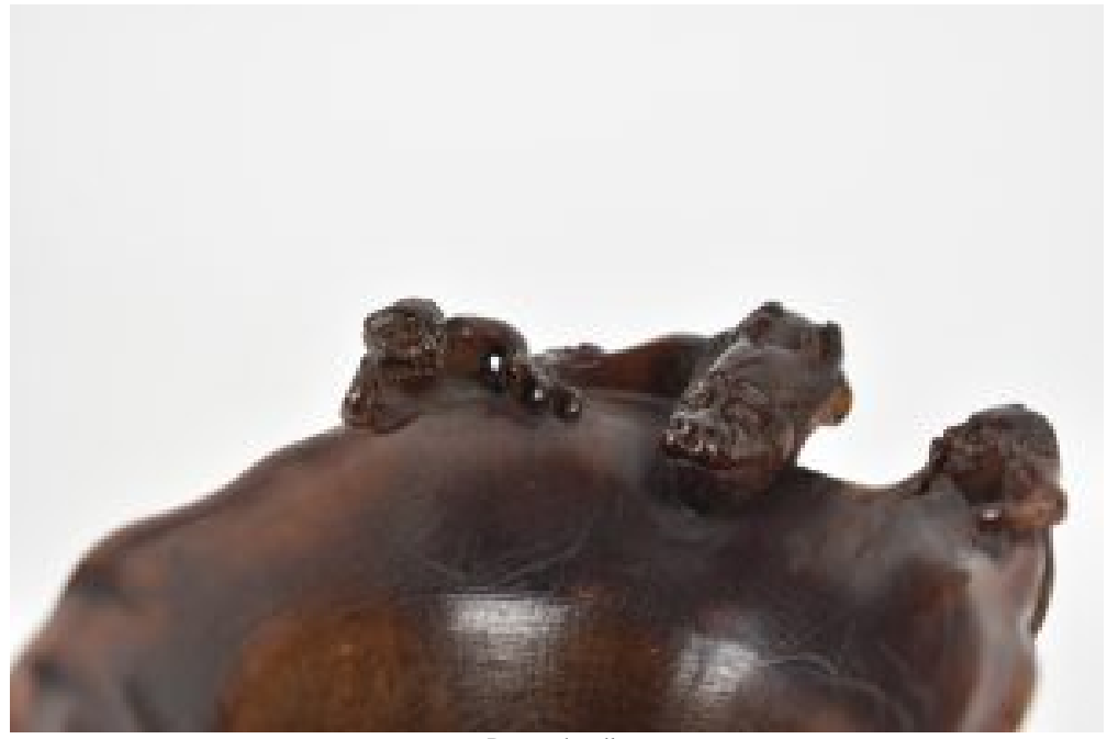
Dragon handle

beautiful dragon with piercing eyes forms the handle to represent the top of the mountain of immortality.