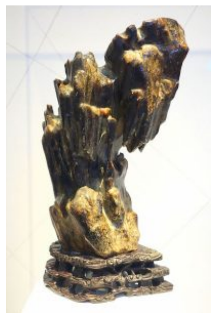
Scholar's Rock Late Ming or early Qing dynasty, 17th-18th century, steatite Exhibit in the Brooklyn Museum – Brooklyn, New York, USA.

Depicting this scene of nature on a rhinoceros horn is the perfect choice of a canvas. The Chinese were often known to bring nature indoors. Ornamental rocks, or Scholars' rocks brought nature closer and into the scholars' studios. Similar to these Scholars' rocks, the rhinoceros horn brought its owner closer to nature.