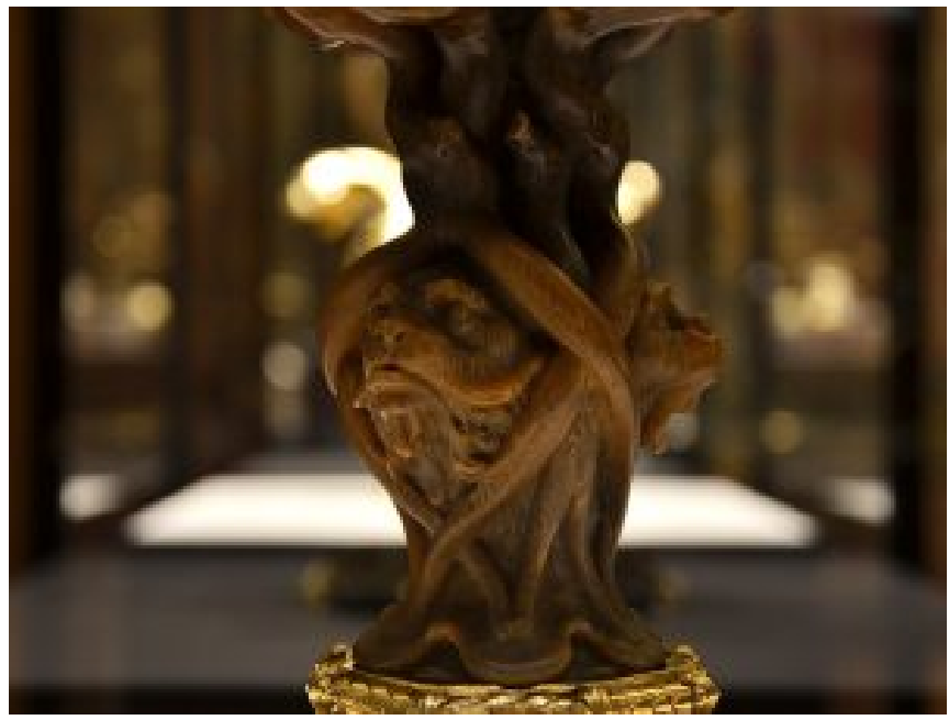
Hapsburg rhinoceros horn carving detail in Kunsthistoriches Museum in Vienna, Austria, 1611.

The collection of Chinese rhinoceros horns carvings in Europe likely started in the sixteenth and early seventeenth centuries. One of the earliest rhinoceros horn carvings featured in a collection was the cups in the Hapsburg Collection curiosity cabinets of Acrhduke Ferdinand of Tyrol and Emperor Rudolf II. Below is a detail of a lion carving from one of these horns.