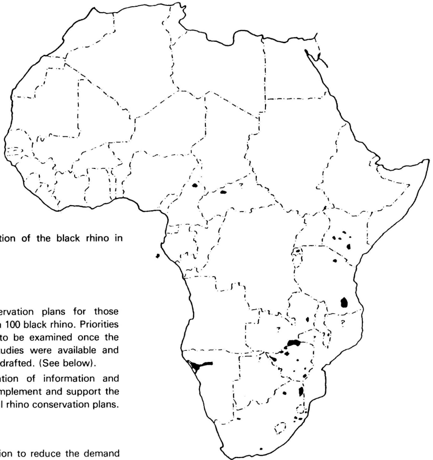
Fig. 2 Present known distribution of the black rhino in Africa.