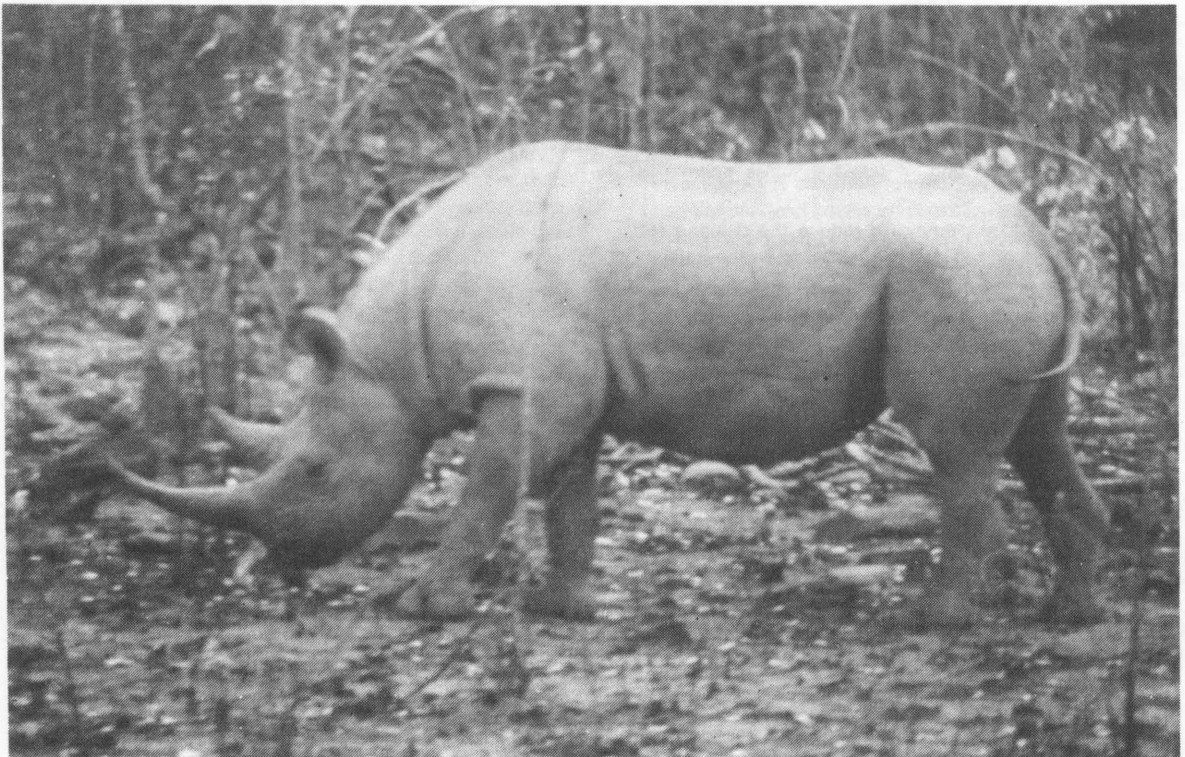
Black Rhino in Chizarira National Park.