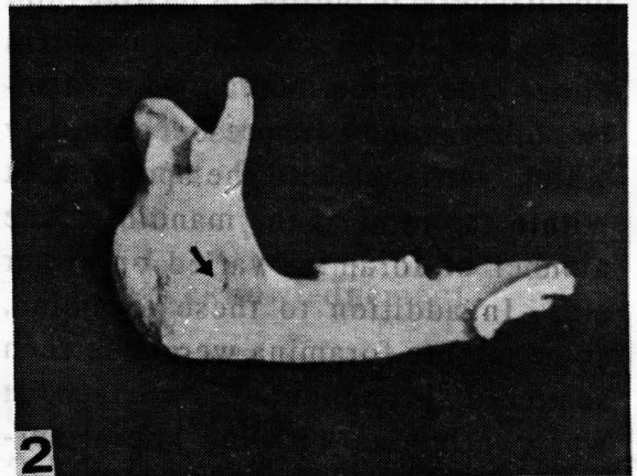
Fig. 2 Medial surface of the mandible of one horned rhino showing the mandibular foramen (arrow)