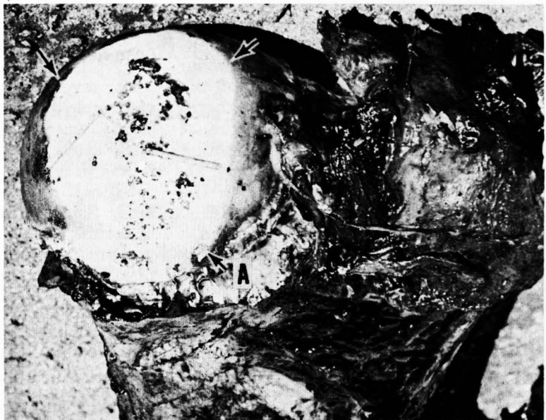
Fig. 2—Right femoral head of rhinoceros described in Figure 1, showing advanced degenerative arthritis. Erosion covering an area 5 by 7 cm. (arrows) exposes underlying cancellous bone. Scalloped exostoses (A) are associated with periarticular edge.