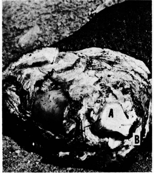
Fig. 1—Distal articulations of metacarpals of an aged black rhinoceros. Left lateral metacarpal has a large eroded area (A), 1.5 by 2.0 cm. Remaining cartilage (B) is darker than normal.

Gross necropsy revealed a severely emaciated carcass and advanced degenerative arthritis. Upon examination of all major joints, it was observed that the articular cartilage had become mat-