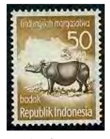
1959, Animal conservation 6 stamps in group – 1 rhino