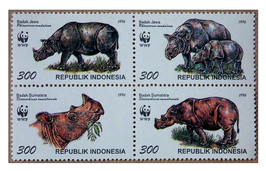
1996, WWF, Rhino 4 rhino stamps

"Dicerorhinus": from the Greek di, meaning "two" and "ceros", meaning "horn" and "rhinos", meaning "nose" and "sumatrensis" referring to Sumatra (with the Latin-ensis, meaning locality)