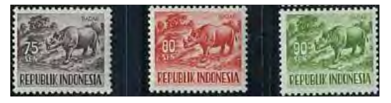
1956, Animals 15 stamps in group – 3 rhinos