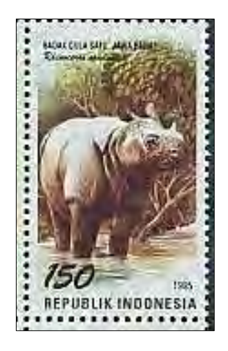
1995, Flora & fauna 10 stamps in group - 1 rhino

The Sumatran and Javan rhinos are near extinction and raising awareness of their plight can be done in many ways by governments. The Indonesian Government has issued a number of stamps with images of the Sumatran and Javan rhinos. All stamps are designed by artists, for the Indonesian Government. Following are some of the wonderful stamps that have been issued by the Government since independence from the Netherlands in 1945.