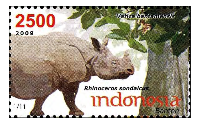
2009, Flora & Fauna 12 stamps issued - 1 rhino