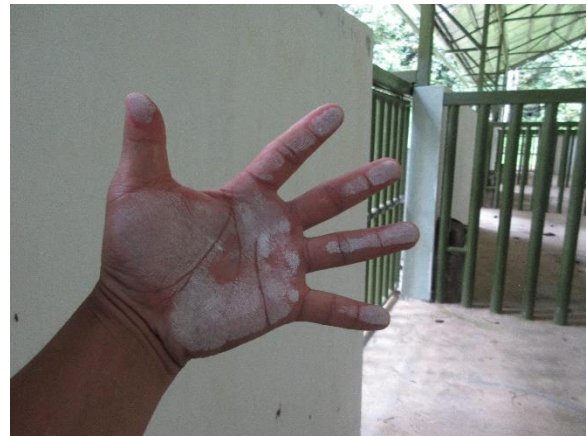
Plate 15. Wall paint coming off in the night stall