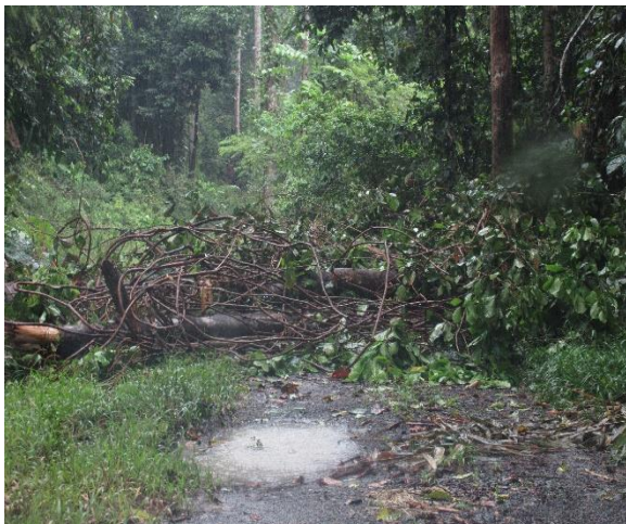
Plate 7. Tree fell along the road to BRS is a common sight