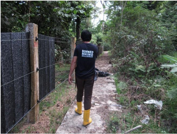
Plate 12. Samat looking at the "open" fence