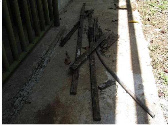
Plate 8. More unwanted rubbish from the construction. Wooden planks with nails and polypipe