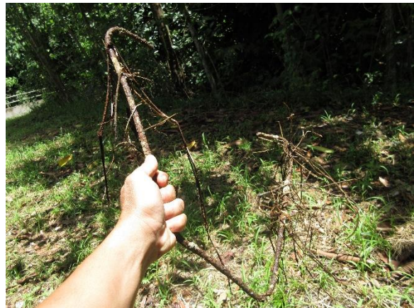
Plate 10. Rusty metal rods and wires are strewn inside the paddocks. These would puncture the feet of the rhinos