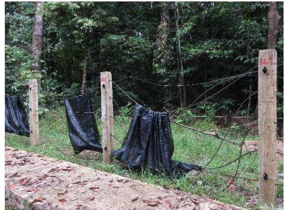
Plate 14. A part of the BRS fence in late August 2017