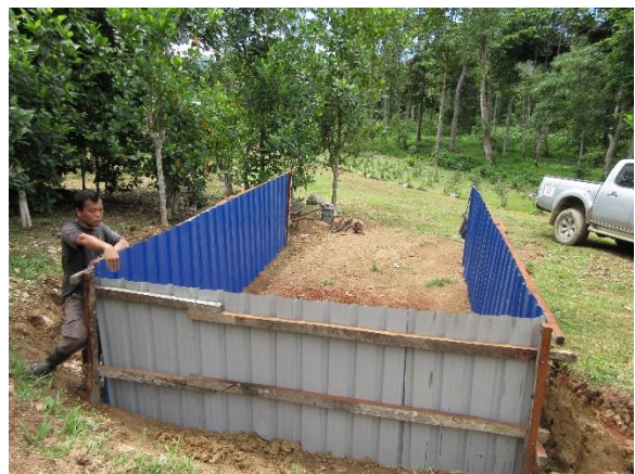
Plate 2. James and the unloading bay for sand