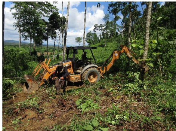
Plate 1. Hasan supervising the bulldozer driver in the RFP

Apart from obtaining two lorry loads of empty fruit bunches from KL – Kepong Sdn. Bhd, they assisted in some excavation work to prepare a loading bay to keep sand and gravels. These raw materials would be used for minor repairing of roads and BORA facilities. In addition, a path/road was also constructed inside the RFP (Plate 1 - 2).