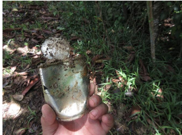
Plate 9. An empty can that would sliced the food pad of the rhino. These food can were left by the construction workers