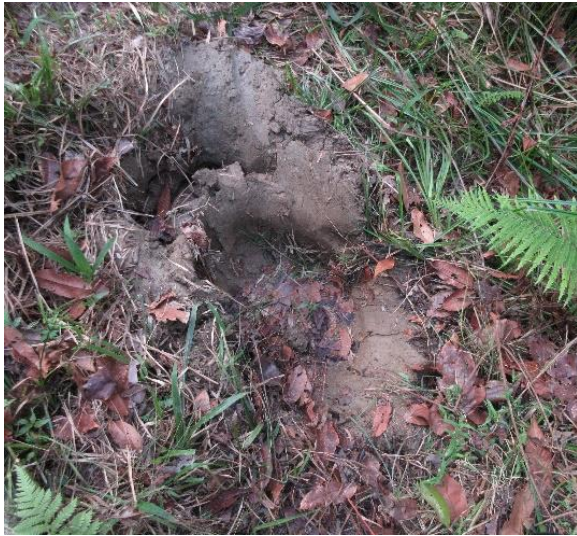
Plate 6. Elephant tracks outside the fence

Nothing changed since the inspection in July and early August 2017. The condition of the the fence, staff quarters, roads and night stalls deteriorated. Wild pigs and deer tracks were seen inside the paddocks. Water tanks are filled up with mosquito larva. Gutters were blocked with leaves and branches. The following are pictures taken in August 2017.