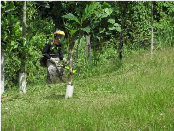
Plate 4. Davidson in full gear cutting the grass in RFP

During the beginning of August, Tabin experienced heavy rainfall and rapid growth of weeds and grass in the RFP. The maintenance had to be carried out more frequently than in Jun – July (Plate 4)