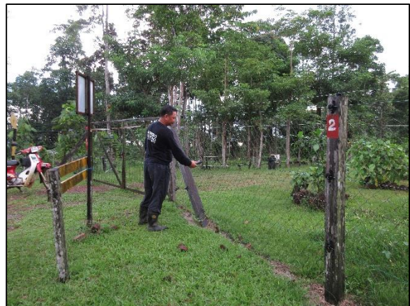
Plate 5. Hasan Sani checking the fence before starting work

The electric fence is checked daily to ensure highest voltage against macaques (in RFP) and elephants. The RIF recorded a low of 8.9 kV and a high of 9.7 kV. The RQF and RFP recorded 8.7 – 9.3 kV and 9.0 – 9.3 kV respectively. The keepers will conduct the checks before letting the rhinos out into the paddocks. In RFP, the field assistants will check the fence in the morning and evening (Plate 5).