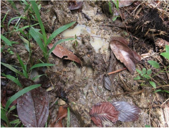
Plate 11. Tracks of wild pigs inside the paddocks