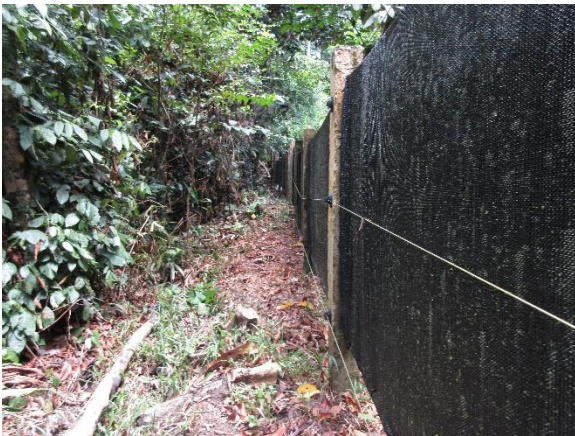
Plate 13. The shrubs and weeds re growing back to cover the fence. Wasted effort to clean up in July 2017

Just to note that these findings were done as a check to the "clean – up" by the contracted staff from Syarikat Pengarah Enterprise (Roger Lee) and monitored by Konsultant Kumpulan (MT) Sdn. Bhd.