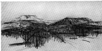
127 FROZEN HILLS 1958