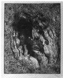
13 DESPAIR 1938