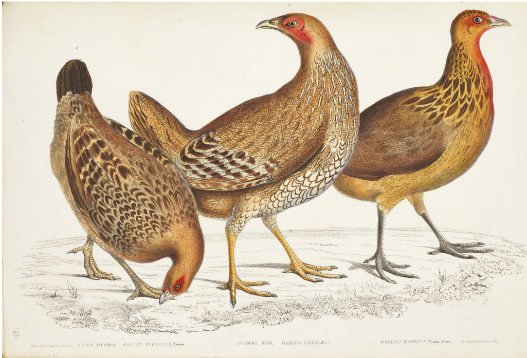
Figure 7. J. E. Gray, Illustrations of Indian Zoology (1832), pl. 43, which shows the females of three species of junglefowl, from left to right: Green Junglefowl Gallus varius, Ceylon Junglefowl G. lafayettei and Red Junglefowl G. gallus bankiva. Gray incorrectly thought that the Ceylon Junglefowl was a new species and named it Stanley Hen, or (in the index) Lord Stanley's Hen