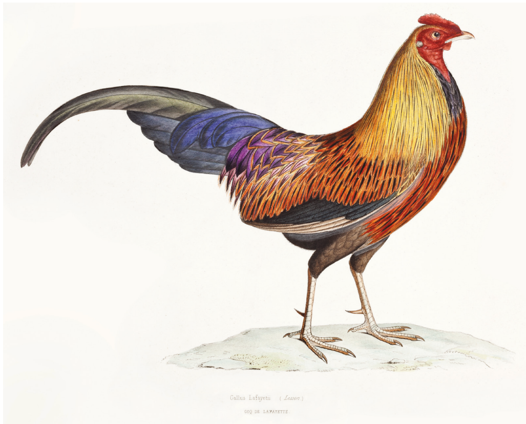
Figure 6. Oeillet Des Murs, Iconographie ornithologique (1845–49), pl. 18: ‘ Gallus lafayettii (Lesson) Coq de Lafayette’

is considered a lapsus (ICZN 1999, Art. 32.5.1) and the corrected spelling G. lafayettii is in common use (McGowan et al. 2017).