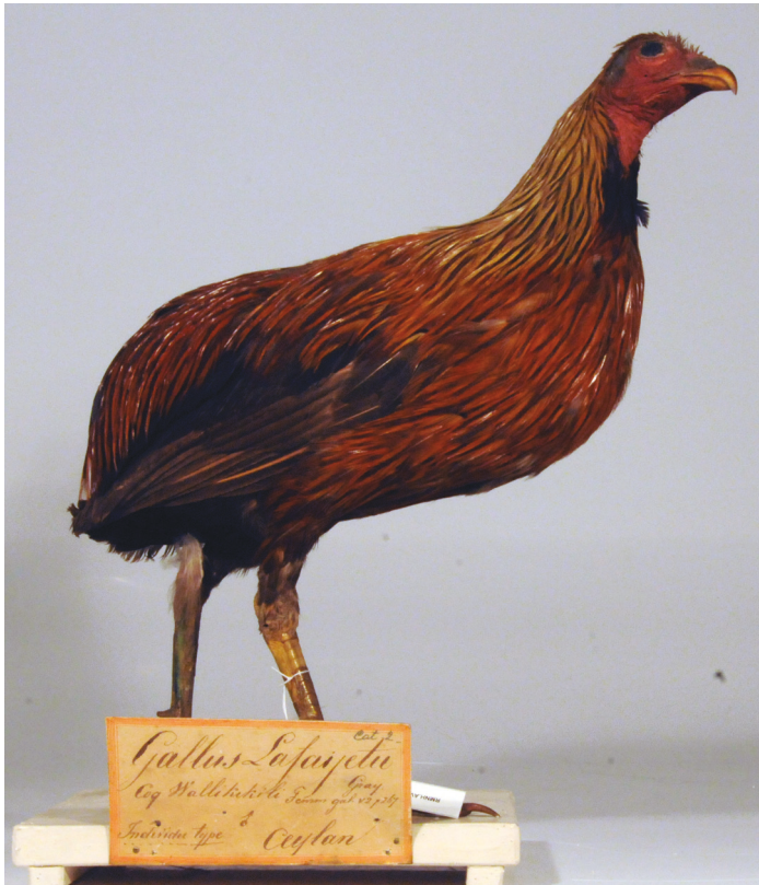
Figure 4. Second syntype of Gallus ecaudatus Temminck, 1807 (RMNH.AVES.224889), juvenile, from Temminck's former private collection (Naturalis Biodiversity Center, Leiden)

The entry is bilingual, Latin and French. Therefore, both 'primus' and 'Espèce primitive' have the same meaning and suggest that Temminck thought these birds represented the ancestral type of rumpless domestic fowl. Temminck referred ('pl. Enl.') to a lithograph of one of the birds that he intended to add to a planned series of descriptions of pigeons and Galliformes; this was never published, but is preserved among his papers in the Naturalis Library, Leiden (Fig. 2).