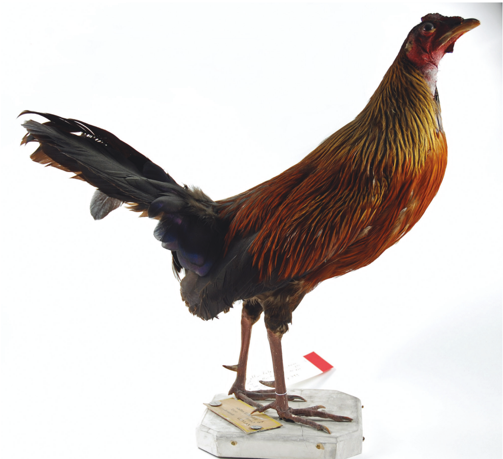
Figure 5. Holotype of Gallus lafayetii Lesson, 1831 (MNHN 2014-393) collected by Leschenault in Ceylon between July 1820 and February 1821 (Muséum national d'Histoire naturelle, Paris)

' Gallus ecaudatus , le Coq sans queue' was bought by 'RM', abbreviation of 'Rijks Museum' (RMNH) in Leiden (Raye 1827). However, Raye's specimen of G. ecaudatus is no longer present in Leiden and could have been exchanged, sold or destroyed during the intervening 190 years; its current whereabouts are unknown.