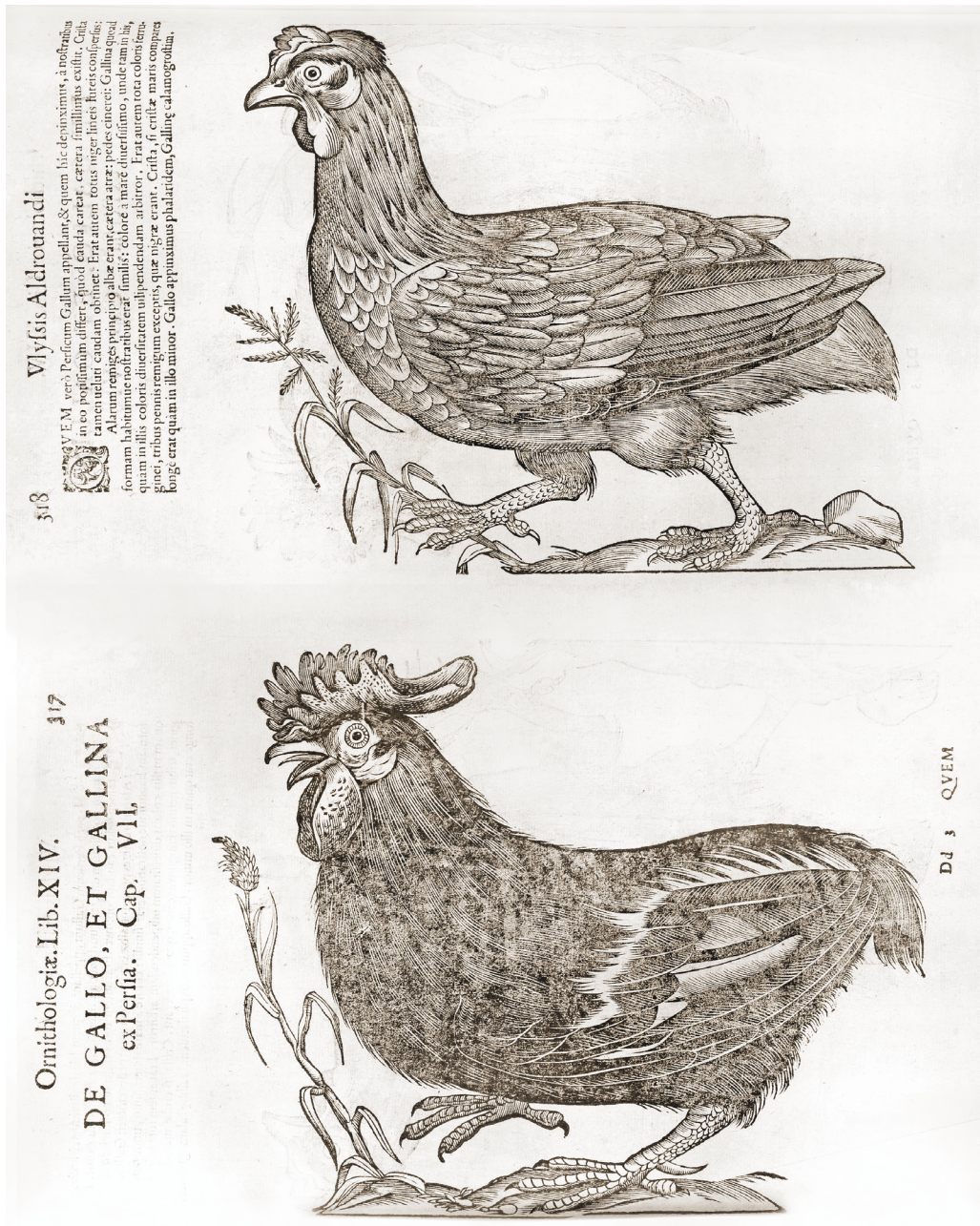
Figure 1. Engraving of Aldrovandi's (1600) rumpless Persian hen and Persian cock

to catalogue his birds in 1799, when he allocated numbers up to 333, adding to these in subsequent years until the list was printed in 1807 (Stresemann 1953). Entry 257 catalogued two specimens of rumpless fowl from Ceylon: '(257) Gallus ecaudatus (primus) (Mas) Temm. Gall. – Le coq sans croupion, ou le Wallikikili de Ceylan (Mâle) (Espèce primitive) – Temm. Gall. v.1. pl. Enl.' (Temminck 1807: 145).