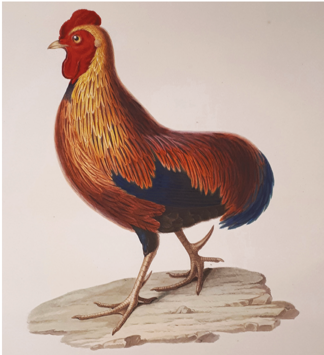
Figure 2. Lithograph of Gallus ecaudatus , based on specimen RMNH.AVES.224888 (Fig. 3), by Jean-Gabriel Prêtre prepared c.1806 for an illustrated work in three volumes that Temminck intended to publish on pigeons and Galliformes. Only the volume on pigeons was published, in 1808, and the two volumes on Galliformes never appeared due to a conflict between Temminck and the French illustrator of the first volume, Pauline Knip (Dickinson et al. 2010). Instead, Temminck later published Histoire naturelle générale des pigeons et des gallinacés in three volumes (1813–15) without any colour illustrations. The reference 'Gall. v. 1. pl. Enl.' in Temminck's published catalogue (1807) refers to the first of the two unpublished volumes on Galliformes, which would have been vol. 2 of the complete work (Naturalis Biodiversity Center, Leiden)