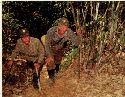
On patrol: Forest guards climb a hill covered with bamboo stands and jungle vegetation in Vietnam's protected rhino area.

Following the Vietnam War, scientists assumed that this subspecies was extinct—until the carcass of a poached animal turned up in a local market stall in 1989. Since then, scientists have been trying to protect Vietnam's elusive pocket of survivors.