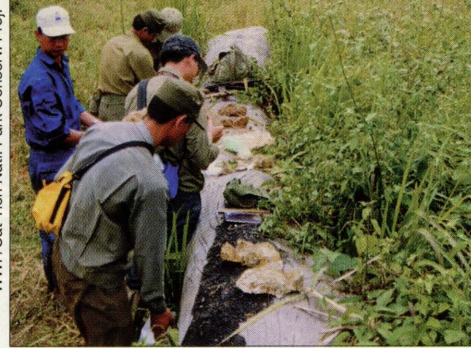
Forest guards place plaster casts of rhino hoofprints on a fallen tree.

exist. As important to species conservators managing recovery of populations is the effective population size—how many animals have relatively dissimilar sets of genes. If the same individual fathered many of the animals in a group, the effective population size would be significantly smaller than the census indicates.