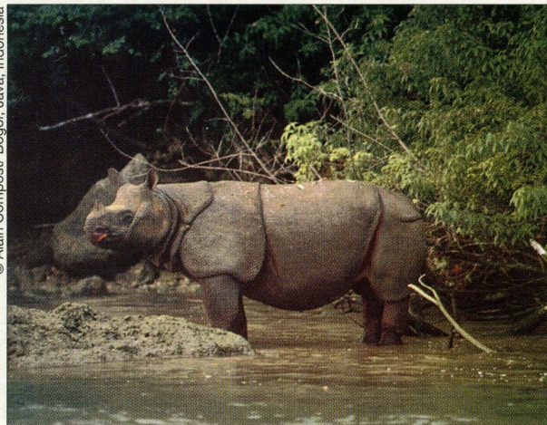
Javan rhino photographed in an Indonesian wallow.