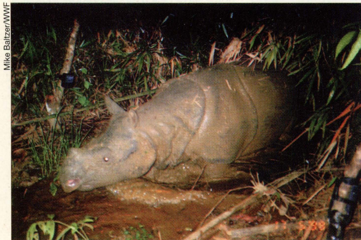
Infrared-triggered cameras recently provided a few images of live Javan rhinos in Vietnam.