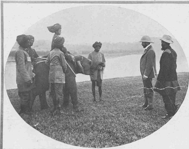
The King with the Prime Minister of Nepal Inspecting a baby elephant which the Premier presented to him

tains seventeen deer, including a pair each of axis, sambar, hog, swamp, and musk deer, whilst there are also thar, serows, goral, and nilgai, and a pair of young yaks. Some very interesting races of sheep are represented, including a pair of the extraordinary single-horned animals. Nothing is known as to their origin. The bony horn cores, though in reality double, have fused except at the tips, thus giving the unicorn appearance. The Nepal collection also contains some very rare pheasants, including cheer, kalege, monal, crimson-horned, and blood pheasants; but these delicate birds are very bad travellers and the society will be fortunate if many of them reach London. The greater number of the animals are being kept in India until March or April, and will be brought back in charge of two keepers from the London gardens.