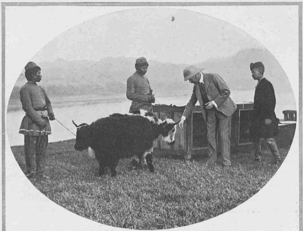
The King inspecting Two Baby Yaks, the Gift of the Nepal Premier Standing behind the King is the Prime Minister of Nepal's son