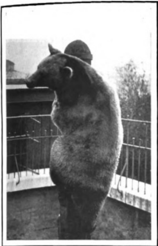
THE CHILDREN'S DELIGHT.

"Punch," the Russian brown bear, who is always hungry.