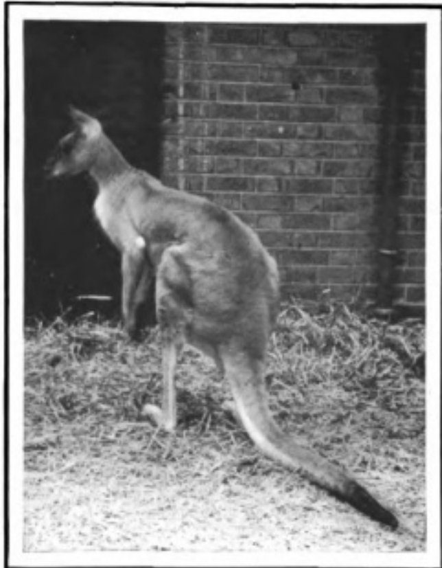
THE GREAT KANGAROO.

"Punch," the Russian brown bear, who is always hungry.