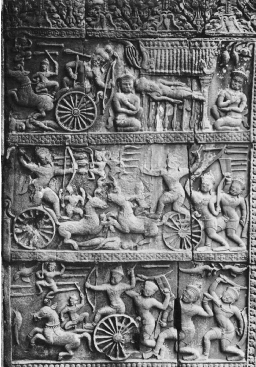
Figure 3. Bas-relief with Mahâbhârata scenes at the temple of Angkor Wat, Siem Reap (Cambodia). Large panel no. 1 of the third enclosure gallery. Dated to the eleventh century C.E. or the first half of the twelfth century. Top: Bhishma on his arrow bed.