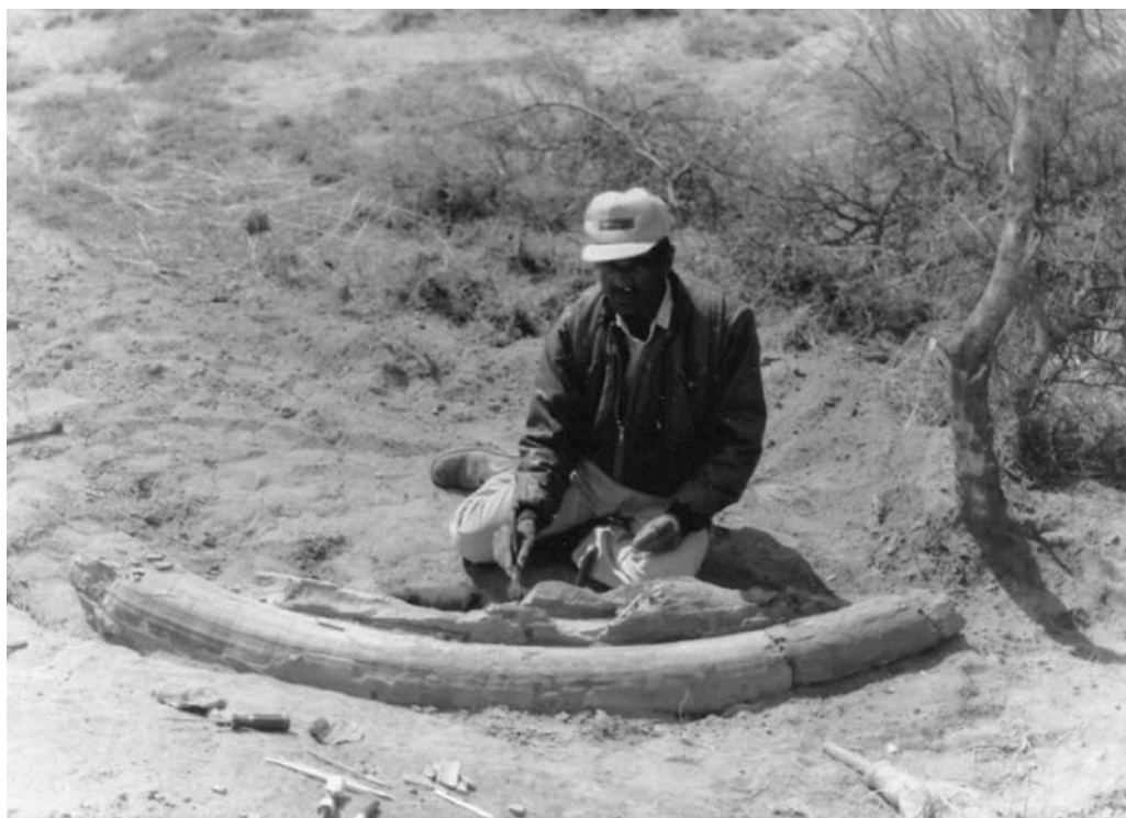
Figure 4. Excavation of a fossil elephant tusk in the Siwalik Hills.

Near the village of Samrota, in the Pinjore valley, a similar story was told about giants who were said to have been destroyed by the hero Ramachandra, as narrated in the epic Ramayana (Nair 2005, 370). The Raja of Nahan (see Figure 1, no. 10) had evidence for the myth—a fossil elephant tooth and tusk fragment—in his collection (Cautley 1834 cited in Nair 2005, 370). The fauna that Falconer found in this area became the type-fauna for a much larger region and was referred to as the “Siwalik Fauna” (Falconer and Cautley 1845–9). The Siwalik deposits are of fluvial origin, transported by river systems flowing southwards from the Greater