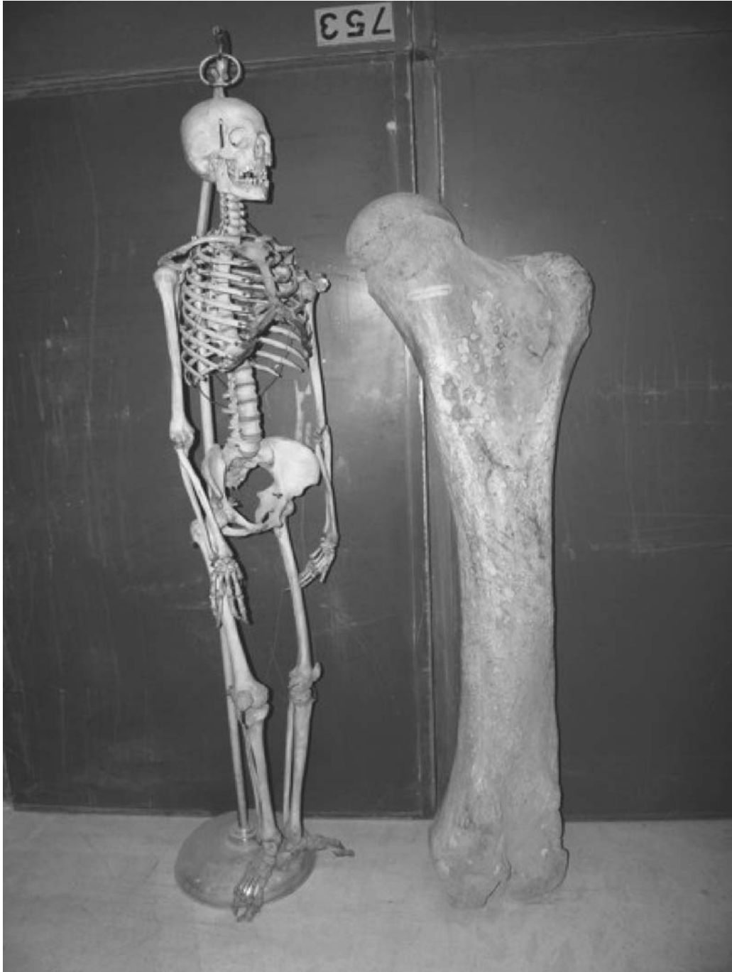
Figure 5. Isolated limb bones of large mammals can be easily confused with those of giant humans: a thigh bone of a fossil elephant next to a human skeleton.