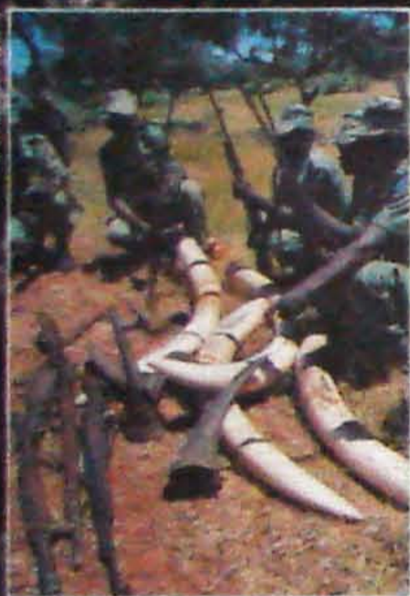
Above: rhino horn, ivory and weapons captured by the Luangwa Valley anti-poaching unit. Right: black rhino

It will soon be too late to save the rhinoceros. The growing demand for rhino horn has resulted in an average of 2,580 of these