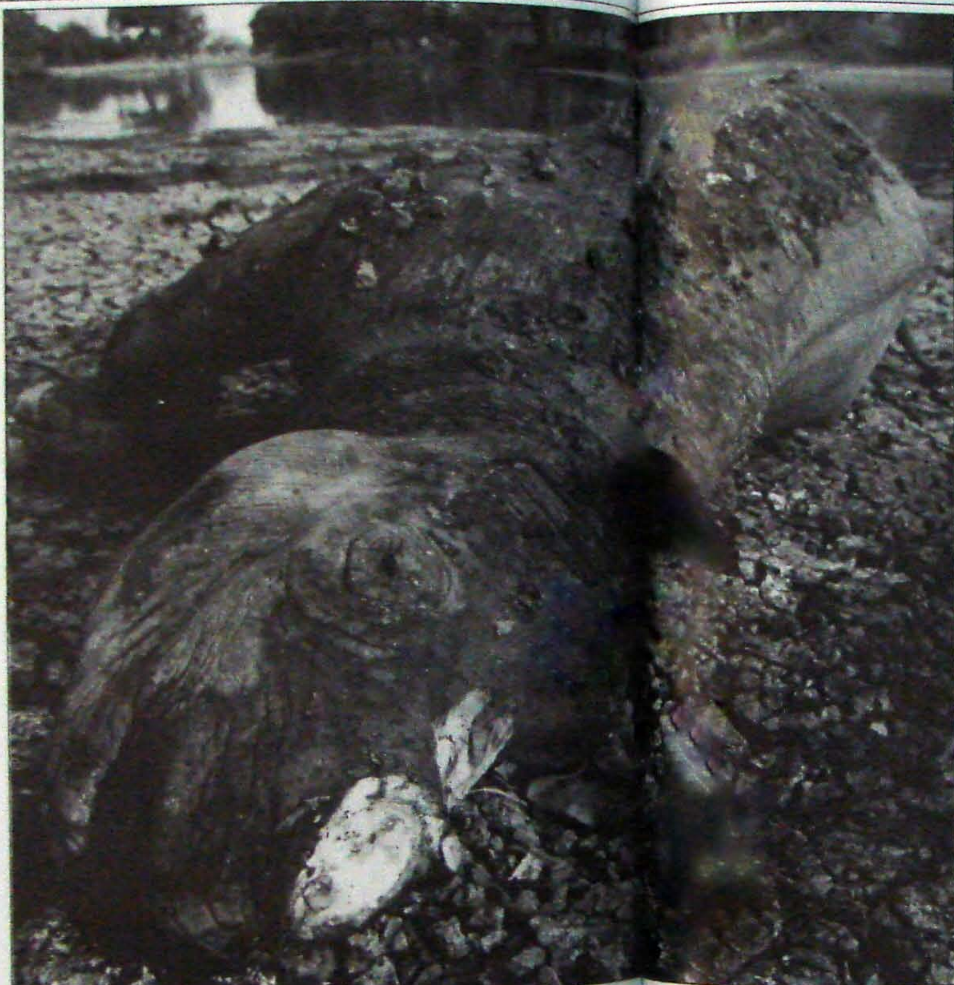
In recent years, the increasing demand for rhino horn has resulted in the killing of about 2,500 rhinos every year, approximately seven rhinos a day

Phil Berry, the commander of the Luangwa team, explains that many of the poachers must by now have shot well over 100