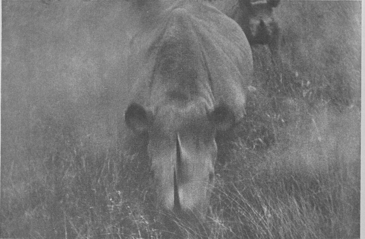
—SO HE LOWERED HIS HEAD AND CHARGED FULL TILT INTO THE RADIATOR ON WHICH WAS LASHED A SPARE TYRE