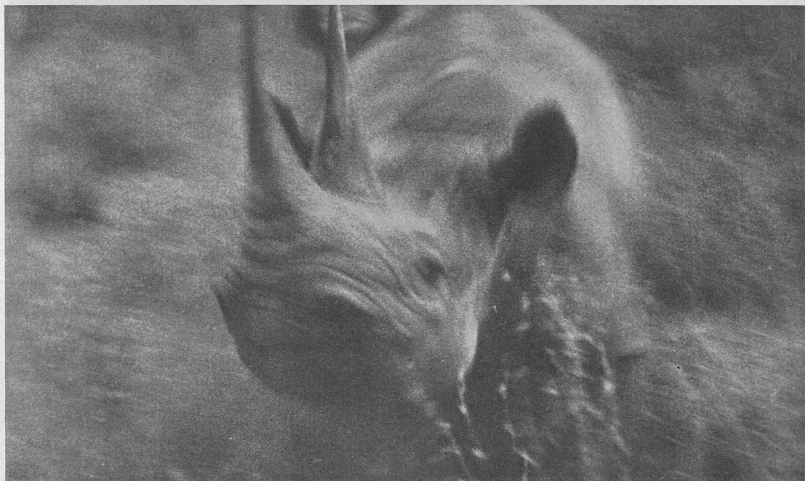
THE RHINO, PUZZLED AND ANGRY, RETIRED FOR A SECOND CHARGE AND OVERTURNED THE LORRY. A PICTURE ON THE FOLLOWING PAGE SHOWS THE DAMAGED LORRY, AFTER THE ATTACK