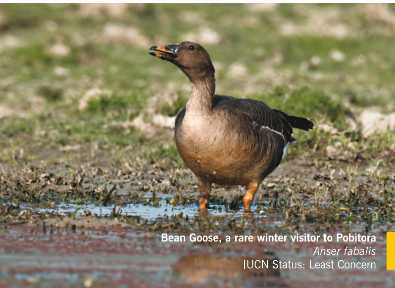
Bean Goose, a rare winter visitor to Pobitora Anser fabalis IUCN Status: Least Concern