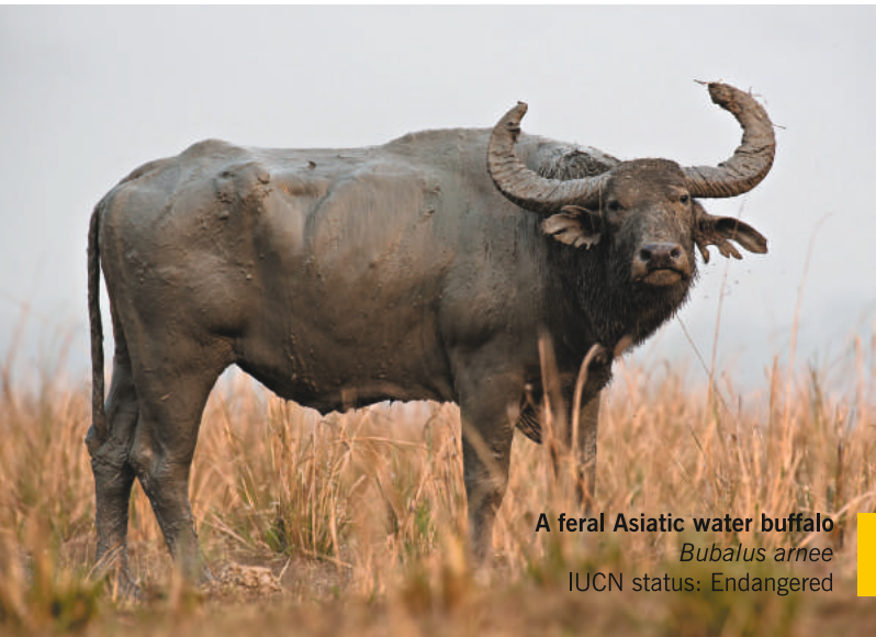
A feral Asiatic water buffalo Bubalus arnee IUCN status: Endangered