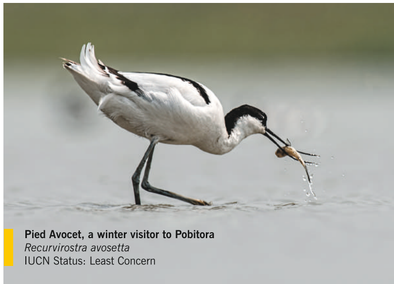
Pied Avocet, a winter visitor to Pobitora Recurvirostra avosetta IUCN Status: Least Concern