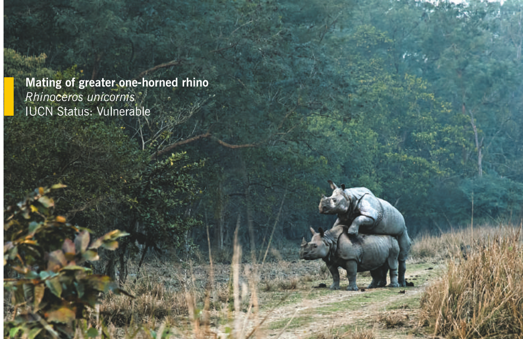
Mating of greater one-horned rhino Rhinoceros unicornis IUCN Status: Vulnerable