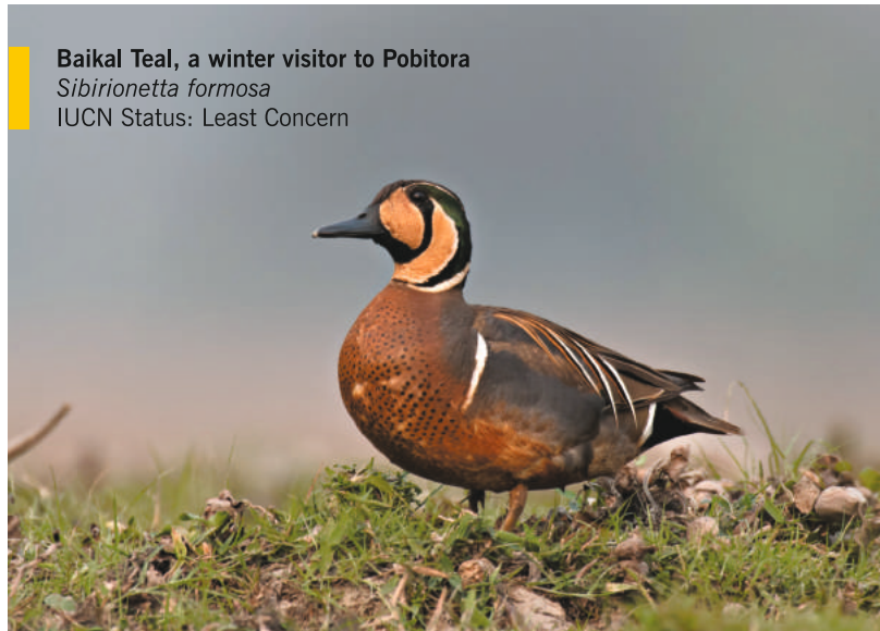
Baikal Teal, a winter visitor to Pobitora Sibirionetta formosa IUCN Status: Least Concern