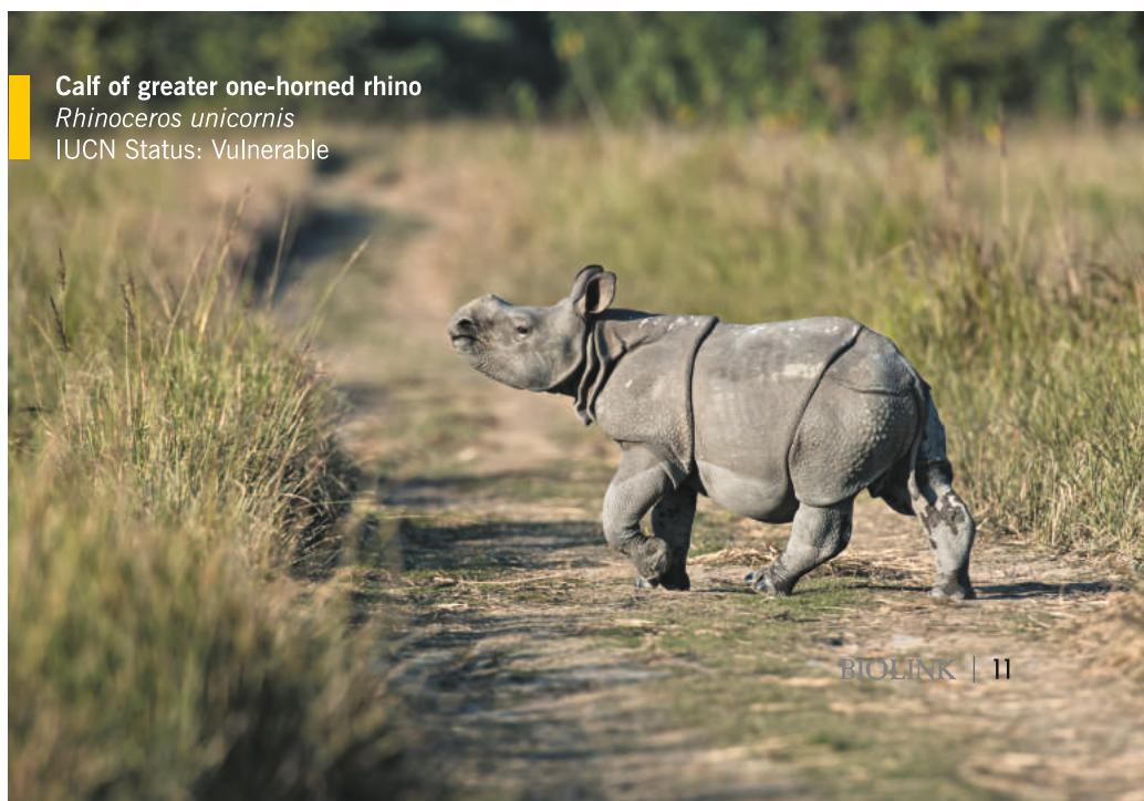
Calf of greater one-horned rhino Rhinoceros unicornis IUCN Status: Vulnerable