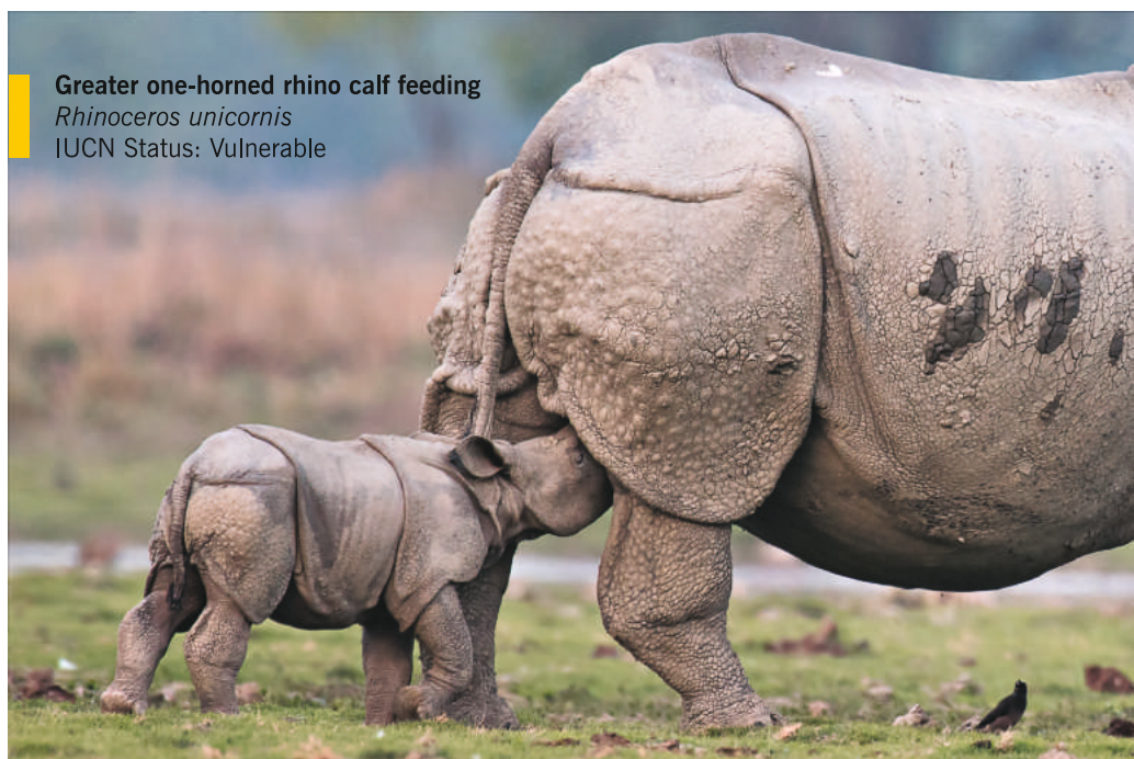
Greater one-horned rhino calf feeding Rhinoceros unicornis IUCN Status: Vulnerable