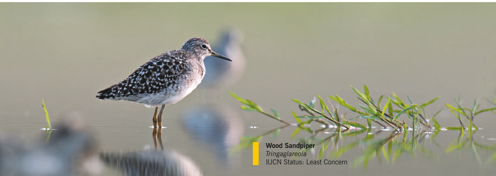
Wood Sandpiper Tringalareola IUCN Status: Least Concern