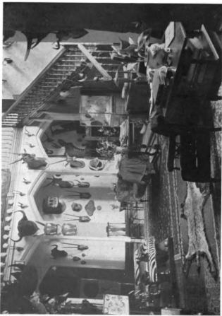
THE HALL AT CHAMPION LODGE.