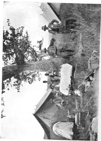
CAMP IN THE TANA FOREST.