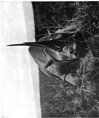
SHOT NEAR THE MELANA RIVER, B.E.A.