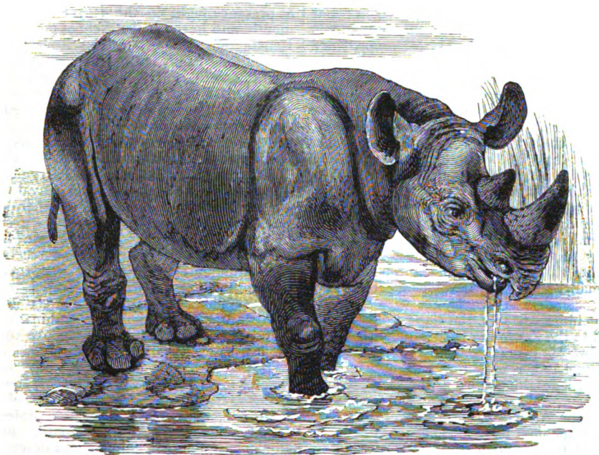
AFRICAN BLACK RHINOCEROS

it Rhinoceros sumatrensis from this circumstance; and our countryman, Sir Stamford Raffles, who obtained it in that island about the same period, likewise proposed to name it after the country to which he believed it to be