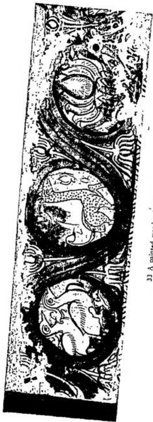
33 A painted wooden book-cover