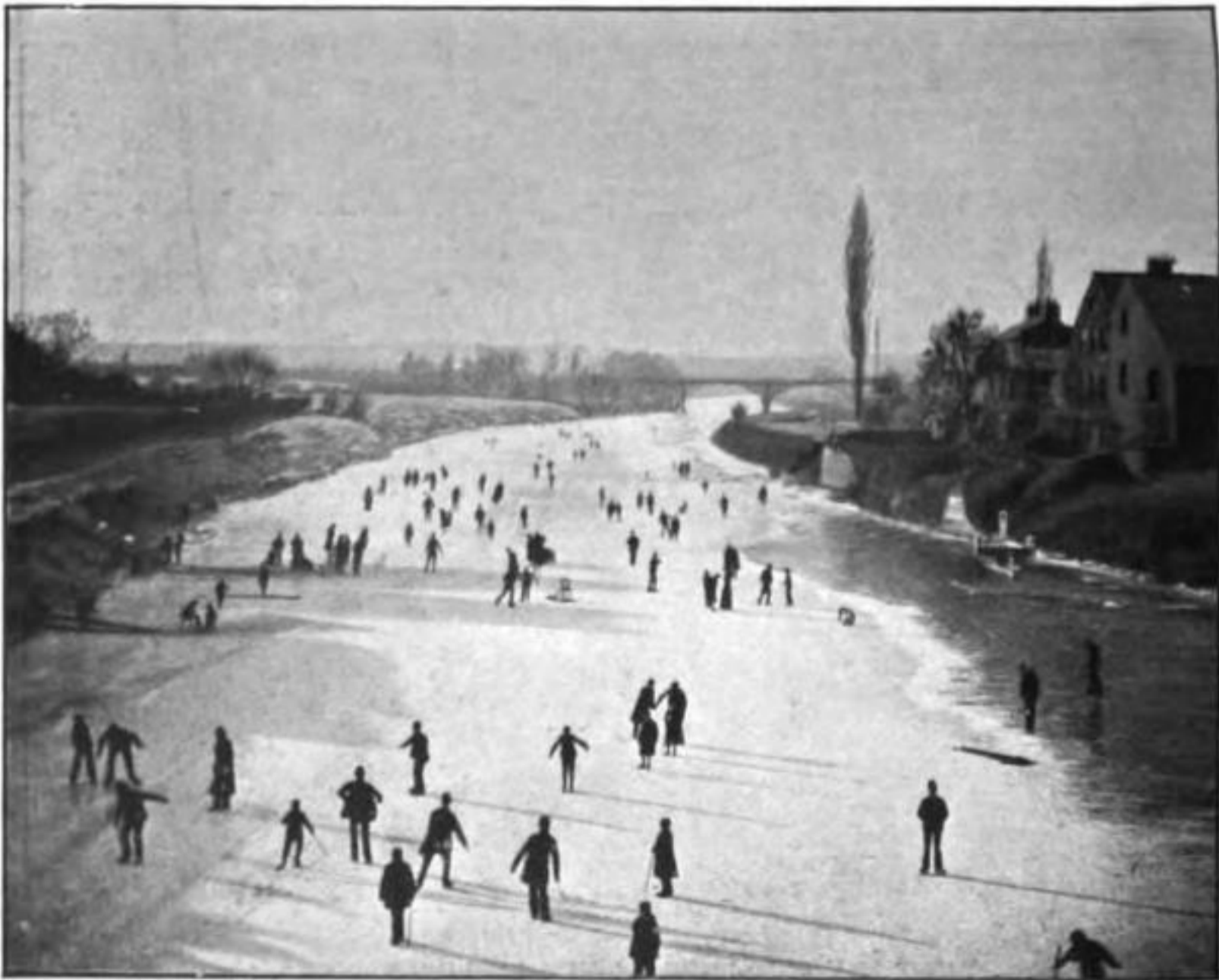
THE FROZEN RIVER