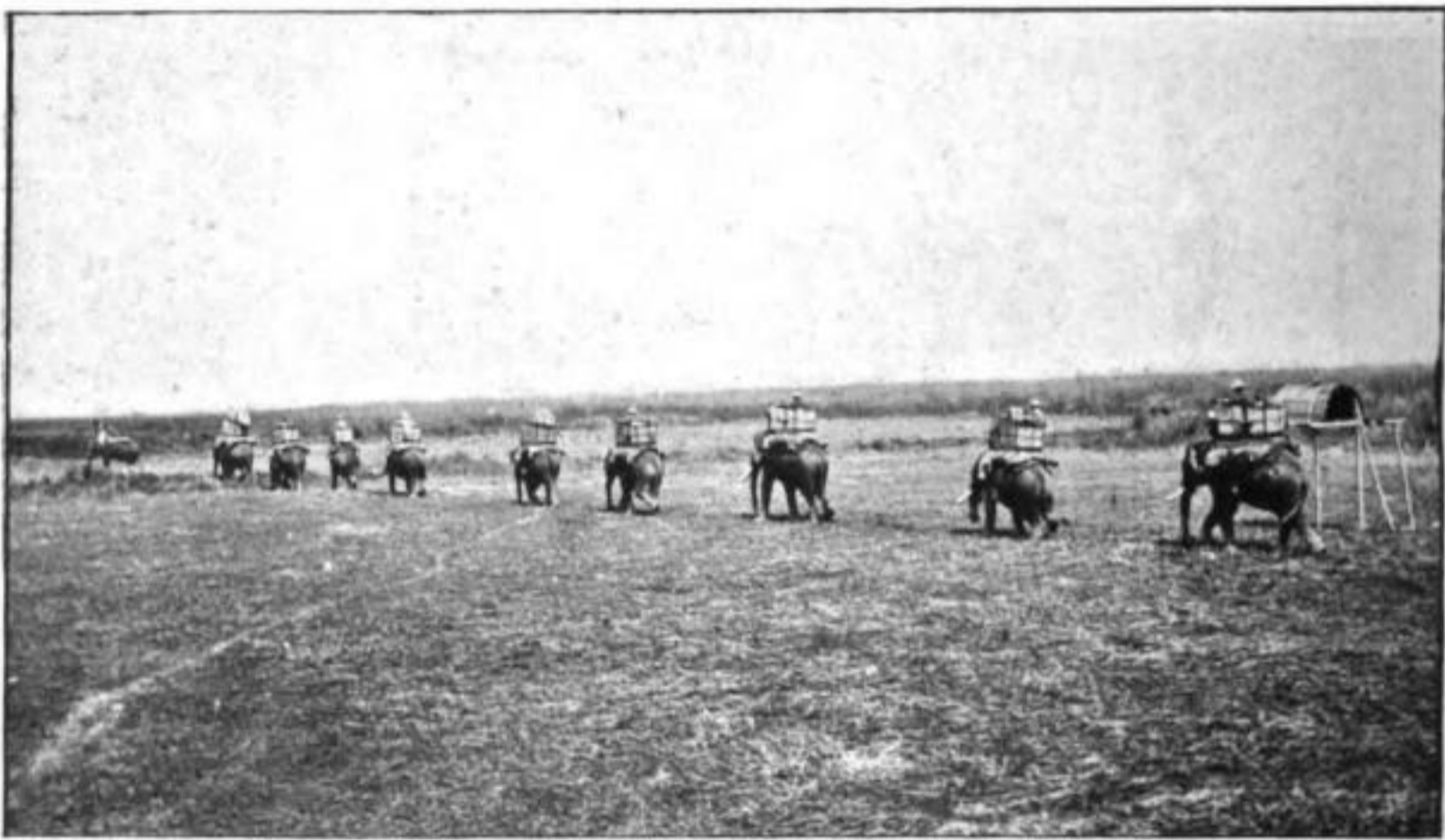
THE 'GUNS' GOING FORWARD (ASSAM)