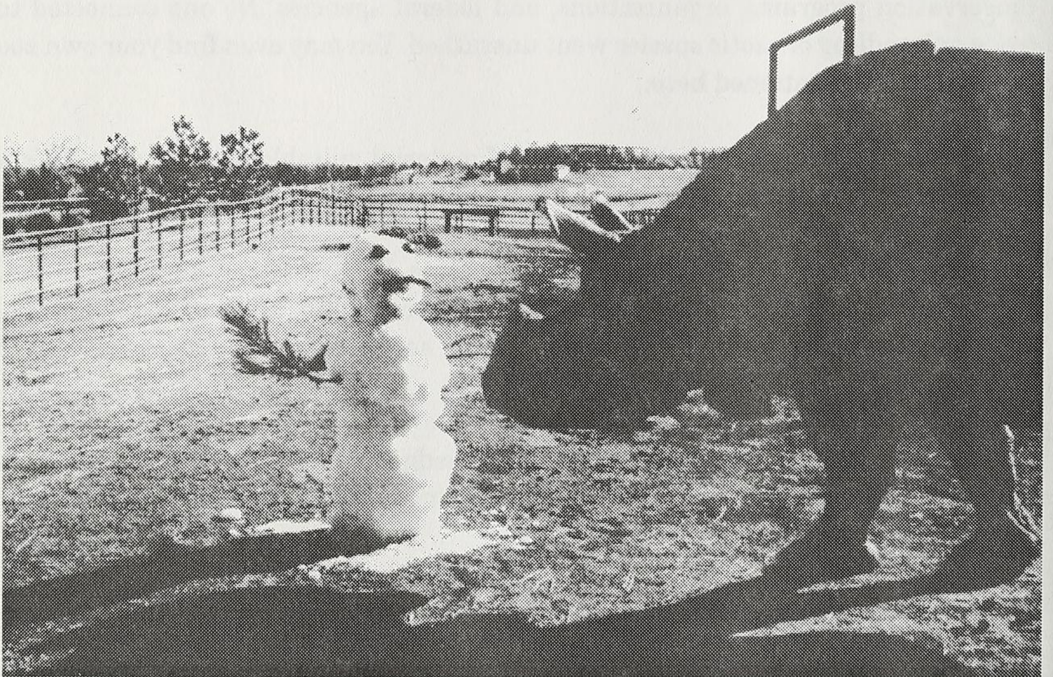
Photo 1: This is when 1.0 Indian rhino Joya was released into his outdoor enclosure with the snowman.