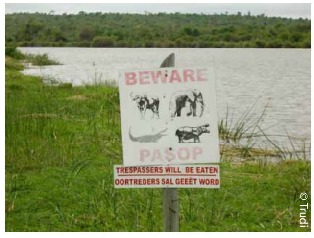
Olifants River (Elephant River)