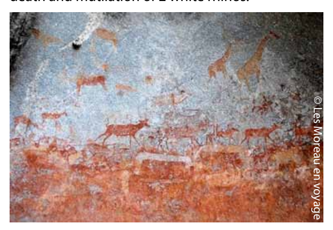
Rock art in Nswatugi Cave, Matopos National Park

The Matopos Hills dominate the granite shield that covers most of Zimbabwe country. Registered since 2003 in UNESCO World Heritage, they are famous for the largest concentration of rock art in Southern Africa. They now report a less prestigious event: the death and mutilation of 2 white rhinos.