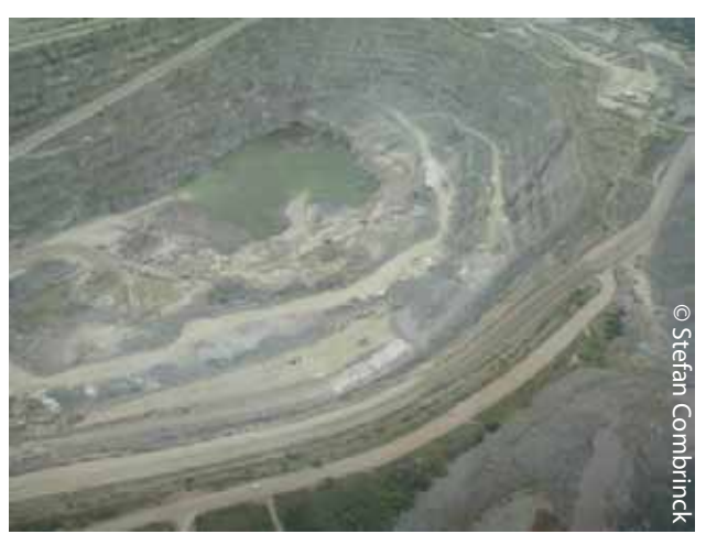
Bosveld phosphate mine in Phalaborwa

The rupture of a tailing dam containing liquid waste from a phosphate mine, on December 28, 2013, caused a surge of acid and toxic sludge to flow into the Selati River a tributary of the Olifants River (Elephant River) which flows into the Limpopo River which in turn drains into the Indian Ocean from Mozambique. Over a distance of at least 15 km, a massive fish die-off was discovered by the Park Rangers, temporarily diverted from guarding the rhinoceroses. Veterinary services are concerned about the direct and indirect impacts of the pollution on crocodiles that feed on the dying or dead fish and the hippopotamuses that splash around and graze on grass in the river and adjacent marshes. Birds could also be impacted by the pollution of the Park and the entire trophic web. The decomposition of the dead fish, mammals, birds and reptiles could also, in the mid-term, modify the water quality and provoke the outbreak of toxic algae such as cyanobacteria. Downstream drinking water sourced from Olifants River, and used to provide water for tourists and staff in the Park, was suspended. According to the mine owners the dam overflow was caused by exceptionally heavy rains whereas other sources point at the poor maintenance of the facilities.