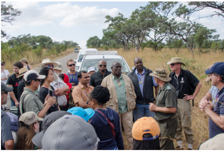
Figure 3: Poached rhinoceros briefing

The second component for this session focused on collecting suitable biological samples from the field from a poached rhinoceros carcass. Given the frequency of rhinoceros poaching in Kruger National Park (an average of just under 3 animals per day) a suitable carcass (from a double rhinoceros poaching incident) was identified and the area was secured and forensically processed in advance to give all meeting delegates access and allow them to fully experience the challenges of the field. International laboratory delegates were again given the opportunity to carry out the sampling from the rhinoceros carcass and use the eRhODIS ® Forensic App developed to be used in conjunction with DNA sampling kits to ensure the continuity of the evidence from a legal perspective. eRhODIS ™ was developed as an adjunct for RhODIS ® to aid in the collection of samples and information relevant to the RhODIS ® project and is already in use in Namibia and Kenya.