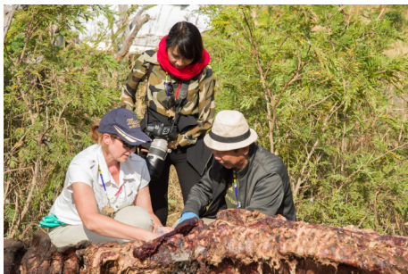
Figure 5: Tissue sample from rhinoceros carcass