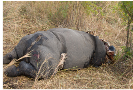
Figure 4: One of the poached rhinos