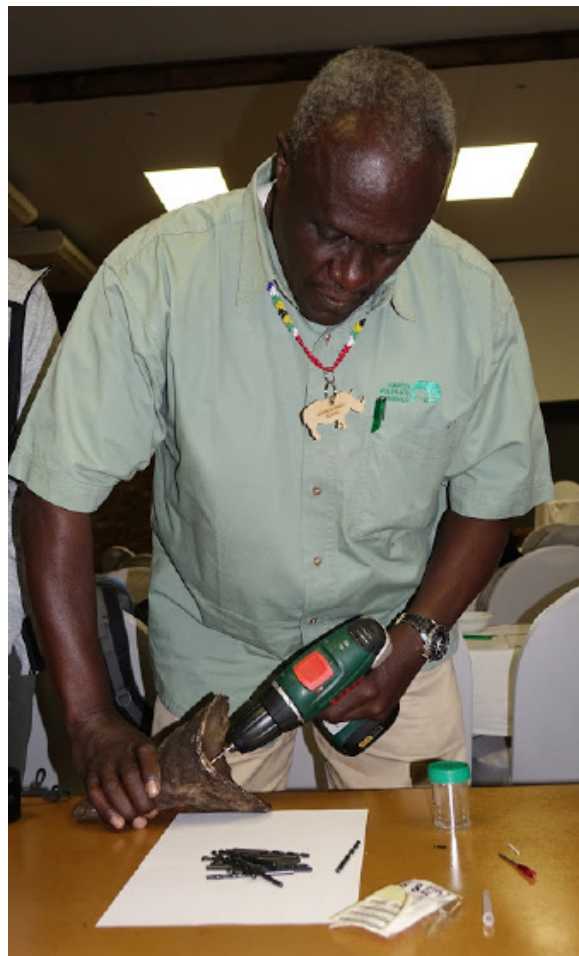
Recovering samples from rhinoceros horn for DNA extraction and analysis

Front cover photograph and credit: White rhinoceros Ceratotherium simum adult and calf Southern Africa and East Africa.