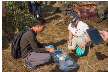
Figure 6: Ensuring chain of custody