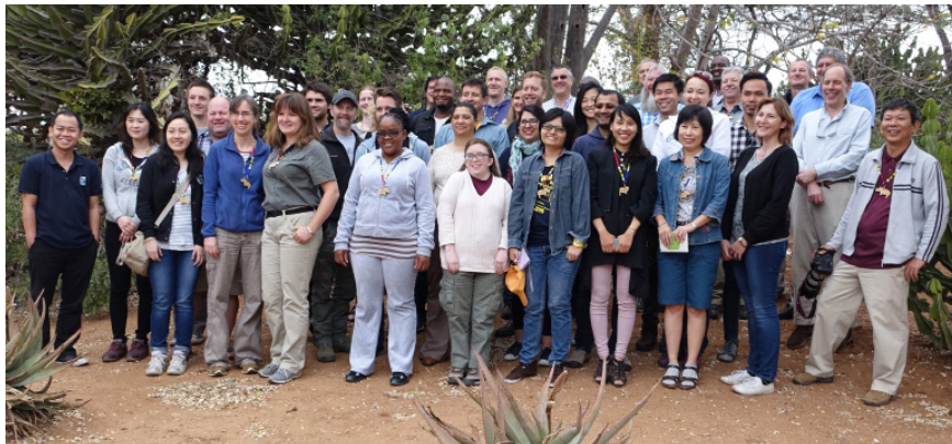
Figure 1: Meeting participant group photograph at Kruger National Park

To enable as fulsome and inclusive discussions as possible, delegates with specific enforcement or DNA technical expertise in this area were invited from rhinoceros range countries and non-range countries identified as key transit or consumer countries for rhinoceros horn. Delegates attended from South Africa, Kenya, Botswana, Namibia, India, Malaysia, Thailand, Indonesia, Viet Nam, Hong Kong, Korea, United Kingdom, Netherlands, Czech Republic and Australia, with additional representatives from TRACE, TRAFFIC, UNODC, USAID, the US Fish and Wildlife Service, and the World Bank. A full list of the participants is shown in Annex 1.