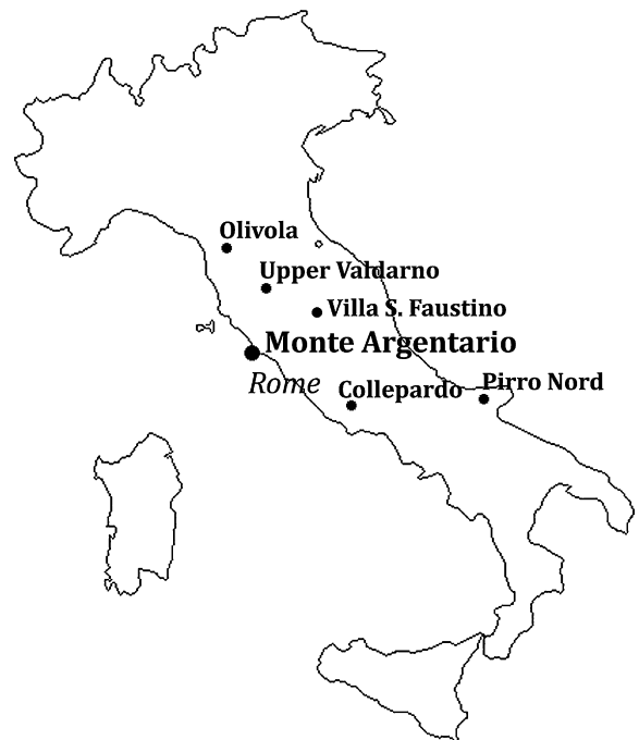
Fig. 1. Location of the Italian localities with Megantereon .

Sardella [22] suggested the use of open taxonomy including the Early Pleistocene European specimens in Megantereon ex gr. cultridens (advanced form).