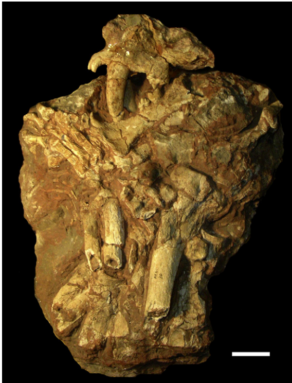
Fig. 2. The specimen ARG 31 from Monte Argentario stored at the Istituto Italiano di Paleontologia Umana (Roma). Scale bar: 5 cm.

The Italian sample includes informative specimens. In particular, for several years the latest Pliocene Upper Valdarno fossils [6,7] constituted a rich basis for comparison in Megantereon studies. Megantereon remains have also been discovered in the Middle-Late Villafranchian faunal assemblages from the Late Pliocene