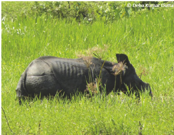
Images 7. Rhino-11 (Maidangsri), female (calf). Date of release: 19 February 2012. Approximate age: 2½ years. Place of origin: Kaziranga National Park