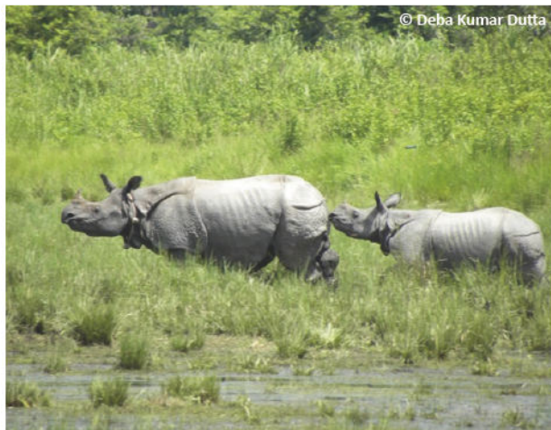
Images 8. Rhino-13 (Swamli), adult female. Approximate age: 12 year & Rhino-14 (Adidiga), male calf. Approximate Age: 2½ years. Date of release: 19 February 2012.