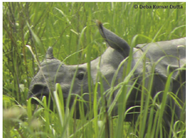
Images 6. Rhino-8 (Giribala), adult female. Date of release: 17 January 2011. Approximate age: 12 years. Place of origin: Pobitora Wildlife Sanctuary