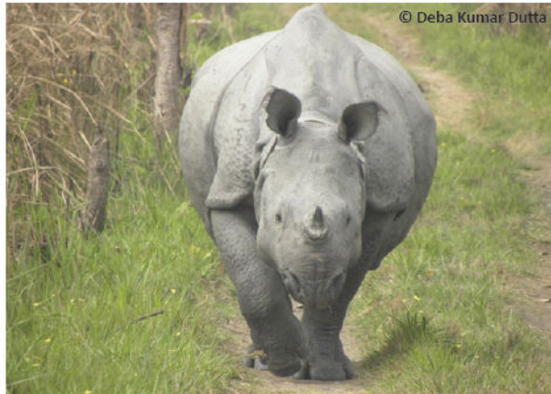
Images 3. Rhino-3 (Laisri), adult female Rhino. Date of release at Manas: 27 December 2010. Approximate age 12½ Years. Place of origin: Pobitora Wildlife Sanctuary