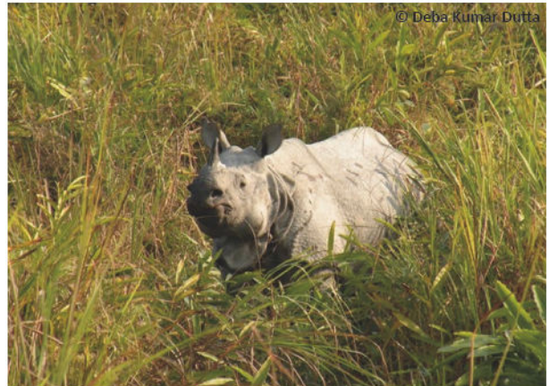
Images 4. Rhino-5 (Manas), adult male Rhino. Date of release: 17 January 2011. Approximate age 10 years. Place of origin: Pobitora Wildlife Sanctuary