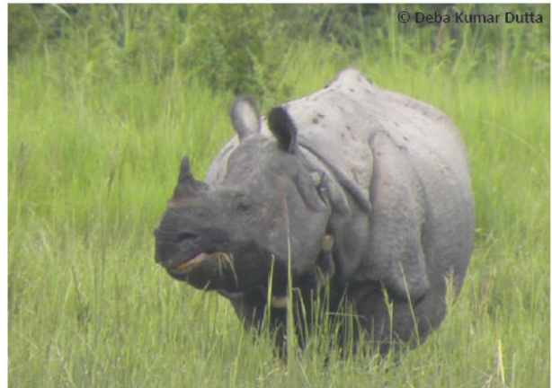
Images 2. Rhino-2 (Iragdao), adult male Rhino. Date of release at Manas 12 April 2008. Approximate age: 10½ Years. Place of origin: Pobitora Wildlife Sanctuary