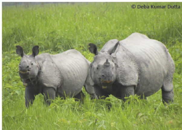
Images 5. Rhino-6 (Xavira), adult female (Cow) & Rhino-7 (Syria) male calf. Date of release: 17 January 2011. Approximate age of mother 13 years and calf 2½ years. Place of origin: Pobitora Wildlife Sanctuary