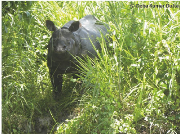
Images 1. Rhino-1 (Sat hazar), adult male Rhino, Date of release at Manas: 12 April 2008 Approximate age: 12½ Years. Place of origin: Pobitora Wildlife Sanctuary