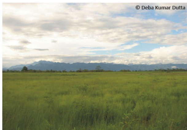
Images 9. A grassland areas of Bansbari range of Manas National Park

conservation in Manas as in Kaziranga Tiger Reserve will be helpful to maintain a population of Rhinos in Manas National Park. Our objective is to have a viable population of Rhinos for which a healthy habitat is vital.