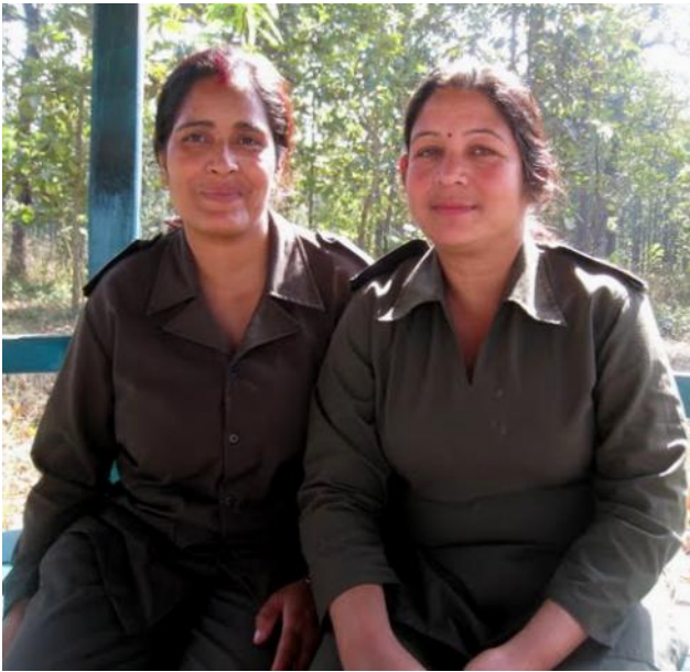
Community forest guards near Chitwan National Park © Teri Allendorf.

similar activity titles, which made it possible to sum the amount spent on specific activities across all of the committees to find total amounts allocated to each type of activity.