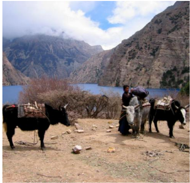
Shey Phoksundo National Park

It was not possible to summarize activities for Bardia NP and Chitwan NP because the management plans did not include activity descriptions that were similar enough across the user committees to understand what the activity entailed. A more detailed understanding of each activity would be needed in order to summarize into broader categories of activities.