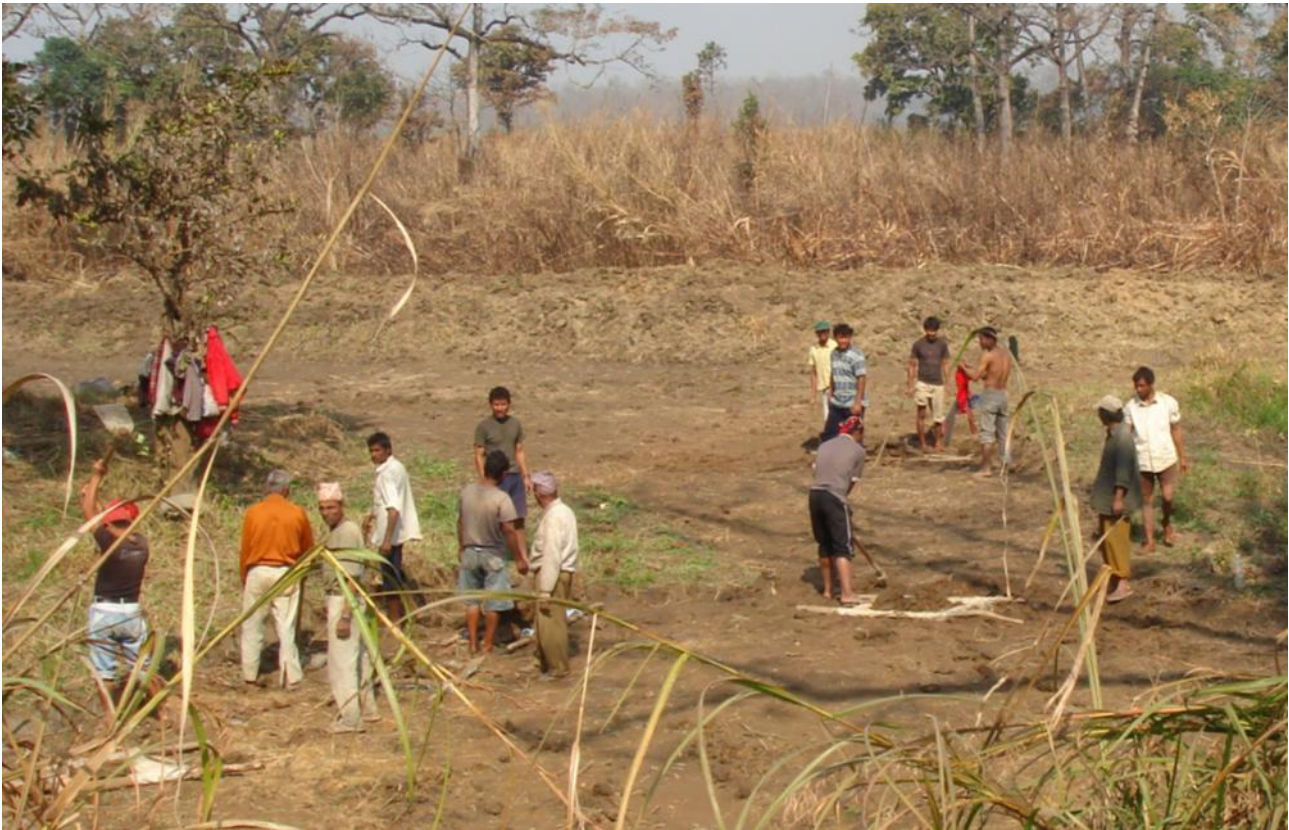
Chitwan National Park grassland maintenance

the second question, to determine if the budgets follow the policy guidelines for buffer zone projects, the budgets in the plans are compared to the provisions in the legislation. For Rara NP and Shey Phoksundo NP, the budget summaries provided in the management plans for each activity category are used. For Bardia NP and Chitwan NP, the management plans did not provide summaries by budget categories, so we estimated total budgets for each activity category by compiling activity lists from the detailed budgets for each buffer zone. To answer the third question, we describe the activities in each management plan.