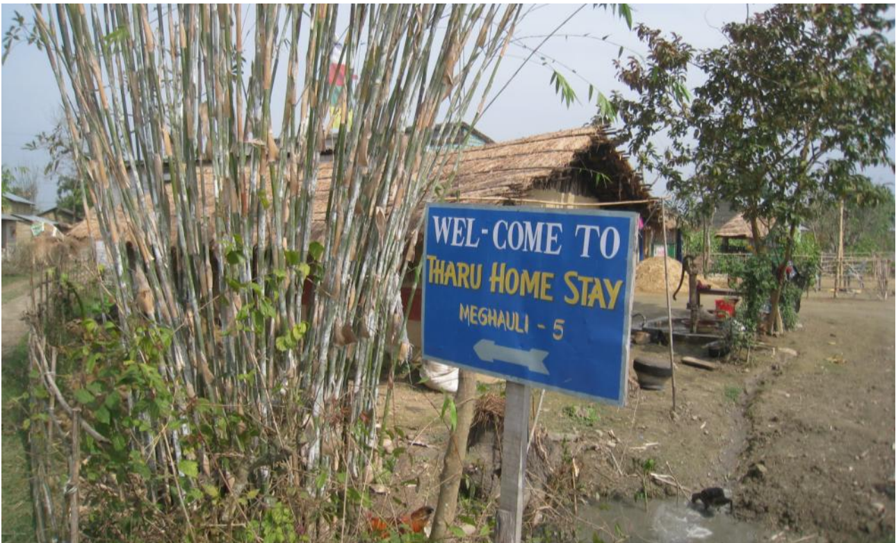
Homestay in buffer zone of Chitwan National Park © Teri Allendorf.

agriculture and alternative energy are in the conservation category while wildlife damage mitigation is listed in development.