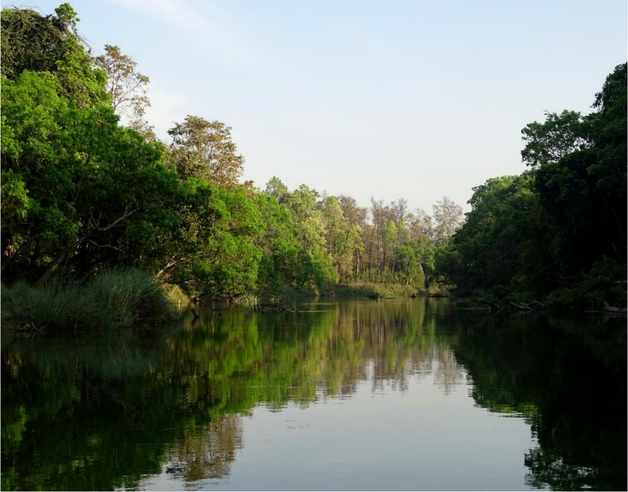
Bardia National Park

development as polarized goals. They have avoided the difficult, if not impossible, task of categorizing activities into discrete categories that reflect some set of perceived conceptual relationships between conservation and development (Kepe et al., 2004; Walpole & Wilder, 2008). These relationships are often conceptualized as categories that reflect some permutation of conservation as helping or hindering development and development as helping or hindering conservation (Salafsky, 2011; Adams et al., 2004). At the national level, the inconsistency of categories and activities in the regulations and guidelines reflects, at least to some extent, the difficulty of clearly differentiating distinct categories. At the protected area level, the inconsistency of activities within the different categories is also probably an indication of the difficulty in practice of defining activities in terms of conservation versus development.