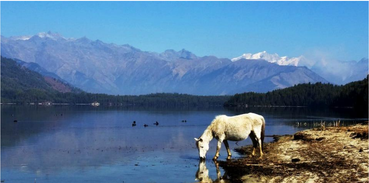
Rara Lake

better prioritization and support of certain activities, especially those that directly mitigate conflicts with wildlife. For example, in Chitwan NP, people felt mitigation of these problems was one of the most urgent community needs (Spiteri & Nepal, 2008). People wonder why, for example, the construction and maintenance of electric fences and other mitigation measures are not prioritized. While the construction of electric and non-electric fences has been funded over the past few decades, through both buffer zone funds and NGO projects, construction has been piecemeal with no plan for funding of renovation or maintenance.