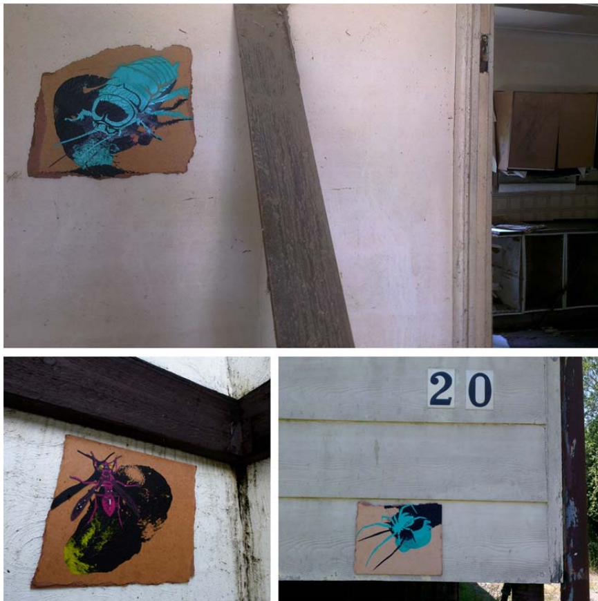
Upper picture: roaming around outer city suburbs like the two-layer Australian cockroach stencil. Bottom left: seven-layer wasp on discarded wooden board flies around an inner-city suburb. Bottom right: two-layer Red Back spider stencil in an abandoned house.

For this issue, I was asked to provide a viewpoint on the experience of public space as someone that has been involved in graffiti and street art for more than ten years. My involvement with these two forms of street interventions, that for outsiders co-exist and for insiders collide, is mostly situated in Bogota, Colombia. The living conditions of the inhabitants of the capital city of a country embedded in more than fifty years of internal violence were, and still are, precarious for many but not so much for me. I was raised in a middle class home and was well taken care of.