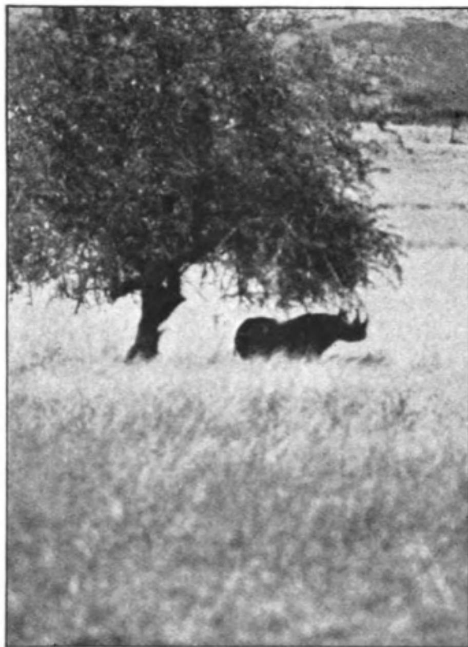
A RHINO DOZING BENEATH A TREE

teeth into my throat and with this grip and her forepaws hang to me while with her hind claws she dug out my stomach, for this pleasant practice is the way of leopards. However, happily for me, she missed her aim. Instead of getting my throat she was to one side. She struck me high in the chest and caught my upper right arm with her mouth. This not only saved my throat but left her hind legs hanging clear where they could not reach my stomach. With my left hand I caught her