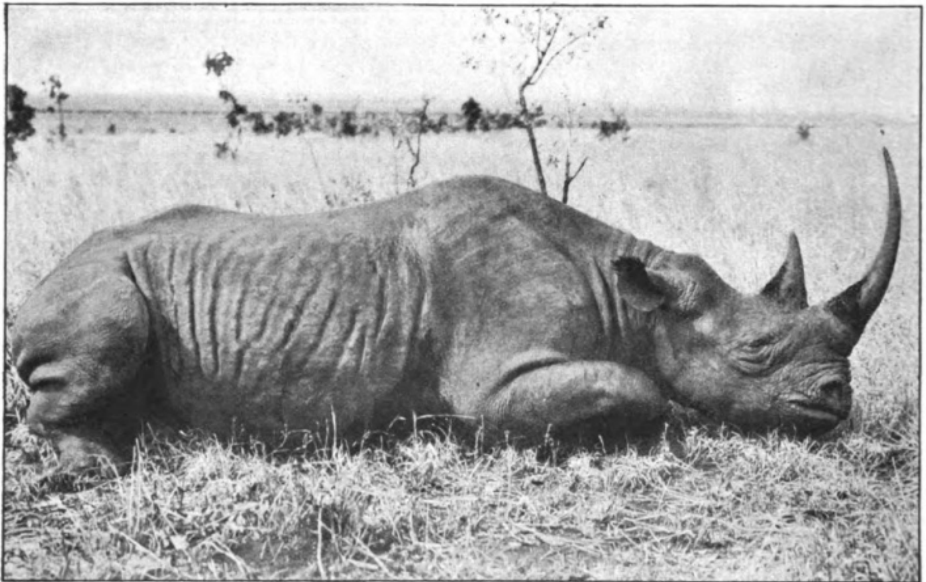
A BULL RHINOCEROS

Mr. Akeley had killed about twenty charging rhinoceroses before he learned that their charges were not necessarily fatal. Since then he has had them charge past him within a few feet, without changing their direction to attack him