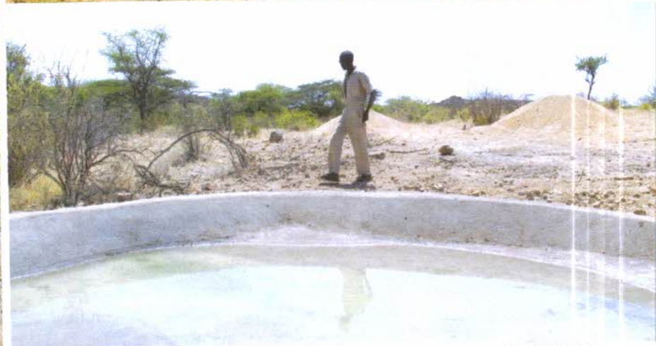
TOP LEFT: A fully equipped new ranger.