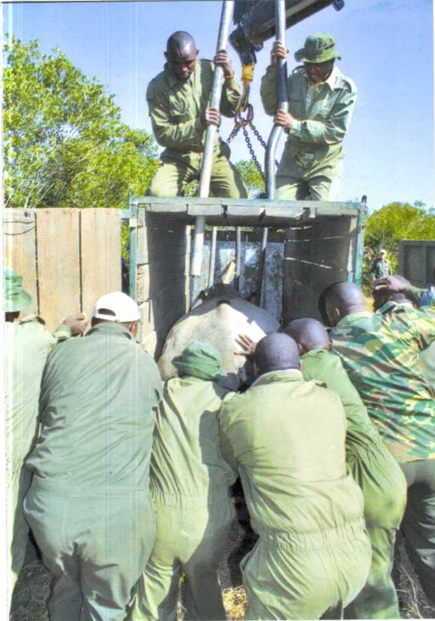
TOP LEFT: A team of rangers load a rhino into vehicle in Ruma.