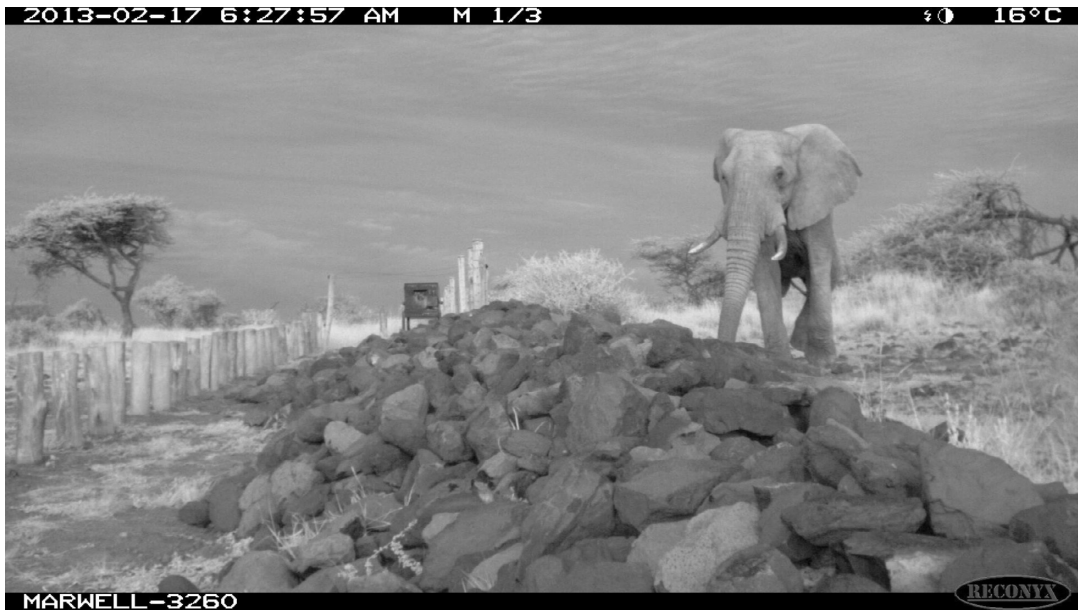
Fig. 2. An elephant returning through the northern fence-gap. Note new bollards to restrict rhino movement. Lewa, February 2013.

spanning the whole length of the fence-gaps (20–30 m). The rock wall, fence-gap design exploited the rhino's perceived poor ability to climb loose rocks. However, in 2012, after two rhinos managed to climb out of Lewa, management modified the fence-gap design by adding low bollards in an attempt to make it more difficult for rhino to squeeze through (see Fig. 2). This specialized fence-gap design, because of its elevated wall-like feature, is not necessarily easily discoverable or scalable and we thus wanted to test its suitability for other species by recoding usage patterns.