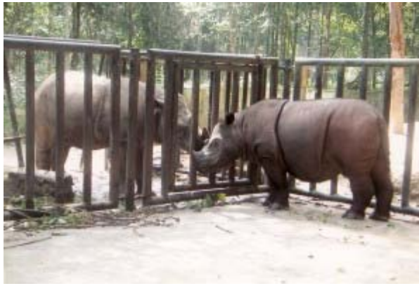
Andalas and Ratu were gradually introduced, after Andalas arrived in Indonesia

a male calf, named Andatu. In September of 2015, it was announced that Ratu was again pregnant, great news for the rhinos.