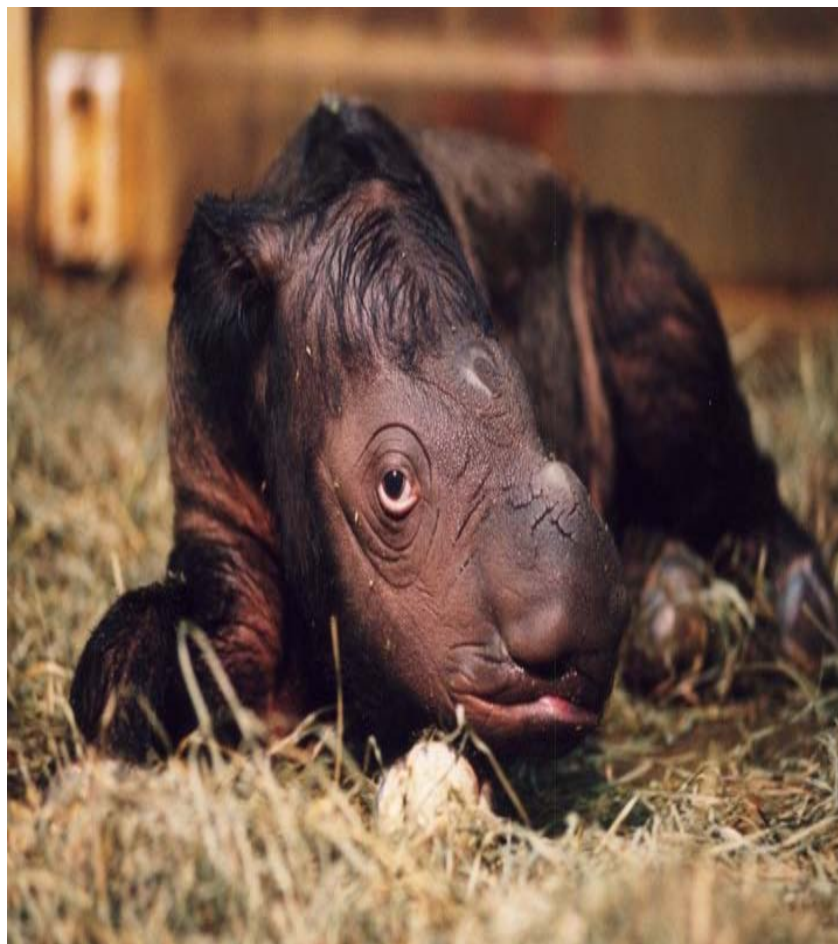
Andalas was the first Sumatran rhino born in captivity in 112 years