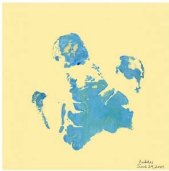
Andalus's footprint, June 24, 2004

departure from Los Angeles in 2007, Andalus—the first Sumatran rhino captive-born in 112 years—had a special visitor. I had invited Steve Irwin, the famed “Crocodile Hunter,” to come out to the Zoo for a tour. We went