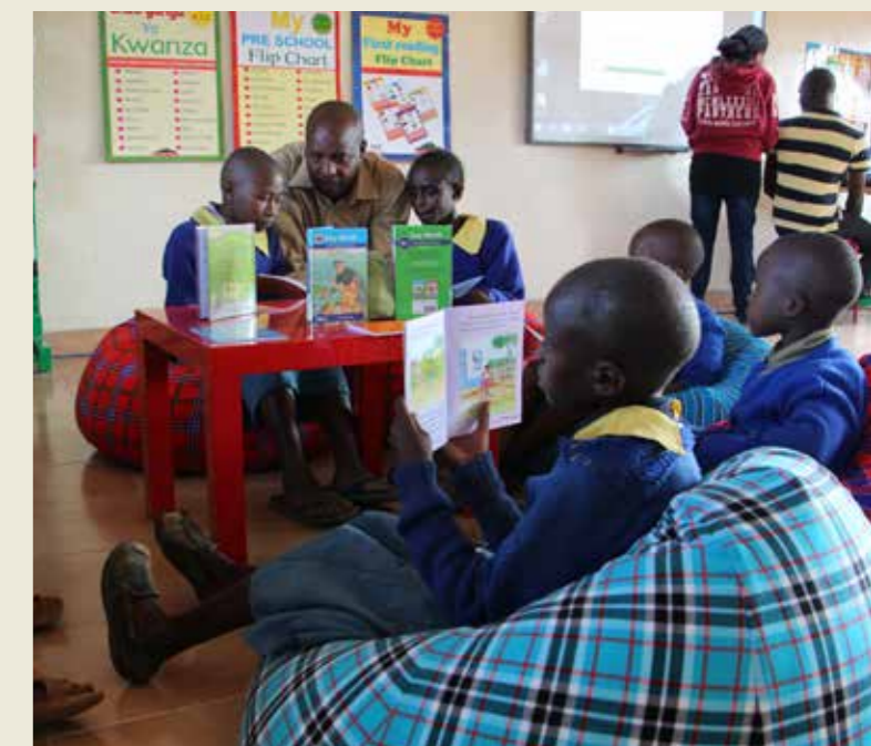
The Lewa School library has created a fun and exciting space for children to learn. In 2015, the library was nominated for the Maktaba Awards, a country-wide recognition of libraries with an impact.

The Charles and Rita Field-Marsham Foundation.