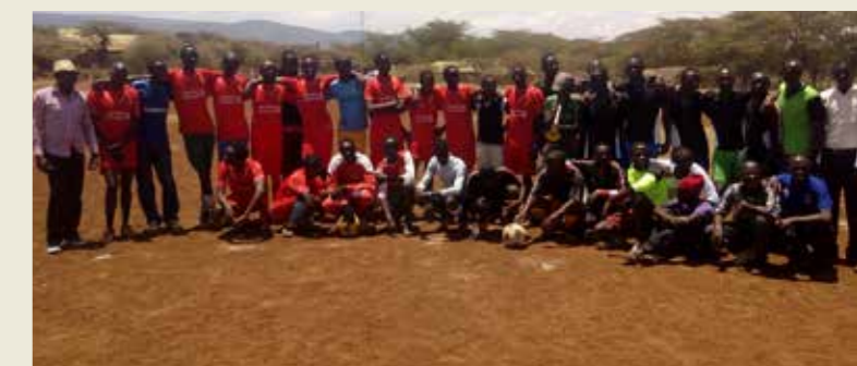
One of the 12 teams that visited Lewa to participate in a football tournament. Sport is an exciting and fun platform for young people to interact, while providing opportunity to discuss development, conservation, entrepreneurship and more.