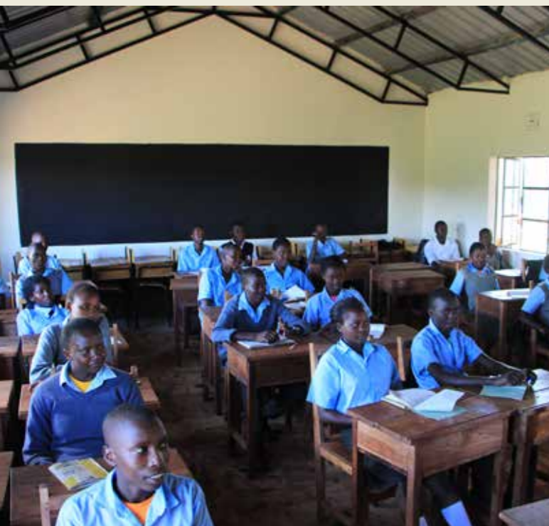
Students of Elsa Secondary School learning in one of the new classrooms. We are working to demonstrate to the Elsa community the ability of conservation to initiate sustainable development.

This overlap of a community need and a conservation imperative necessitated our involvement in the schools, serving to bring the larger Elsa community on board as conservation partners.