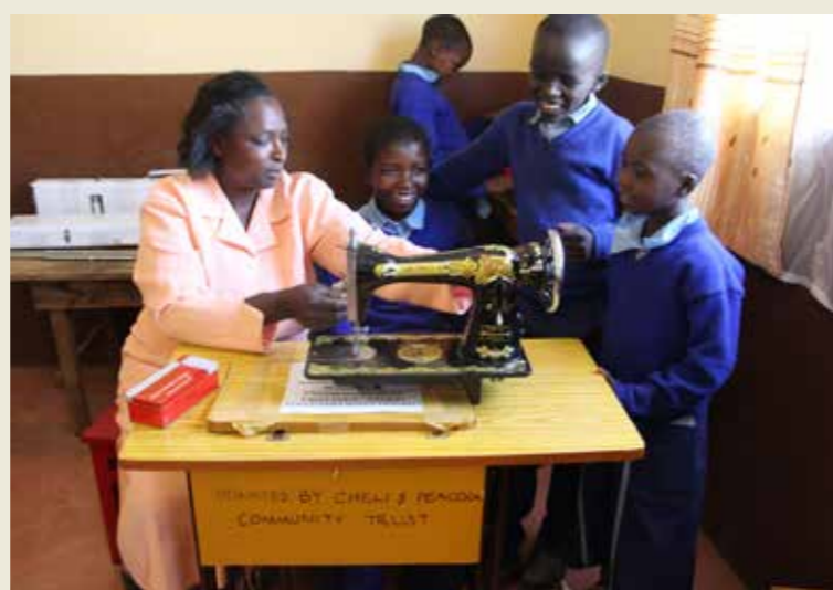
The children and their teacher test a new sewing machine donated by Cheli & Peacock Community Trust. The new learning facility has created a platform that enables teachers to pass on skills to the children.