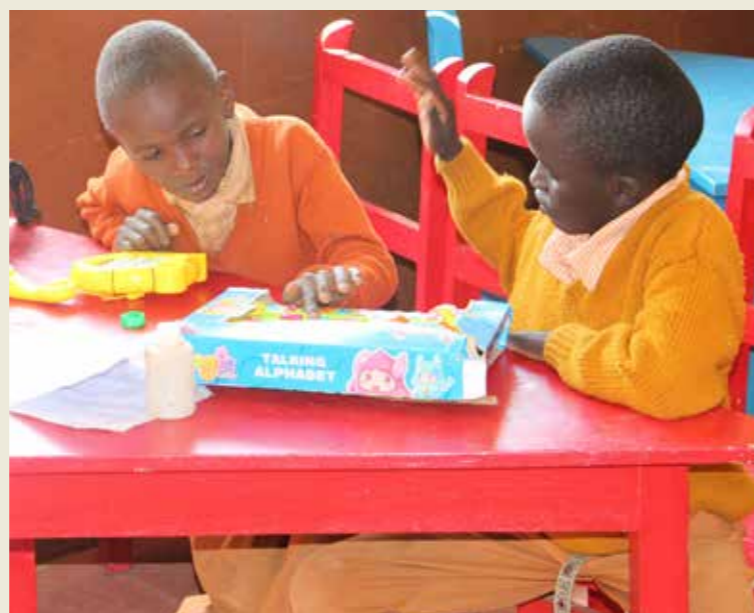
Children with special needs at Ntumburi Primary School now have a new facility to promote their learning and school experiences. The facility provides a fun and beautiful environment for the children.