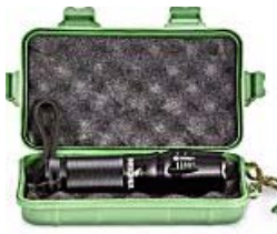
New Military Grade Flashlight Is Sweeping the G700 Tactical Flashlight