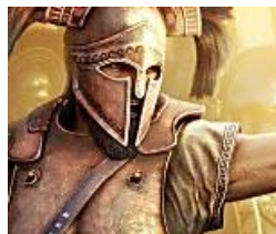
Sparta : The Strategy Game Phenomenon of Sparta Online Game