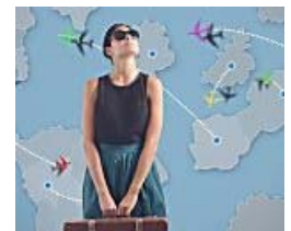
Fly Around The World The Easy Way Fortune Skyteam -