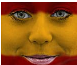
8 Fantastic Spanish Words We Should Be Using in Babel