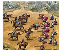
Gamers around the world have been waiting for this Forge Of Empires - Free