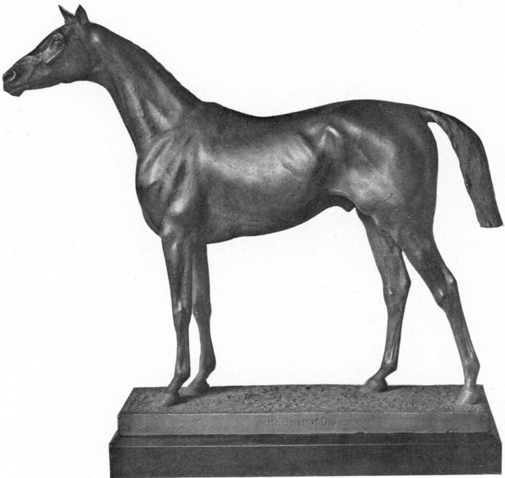
STATUETTE OF "PERSIMMON."