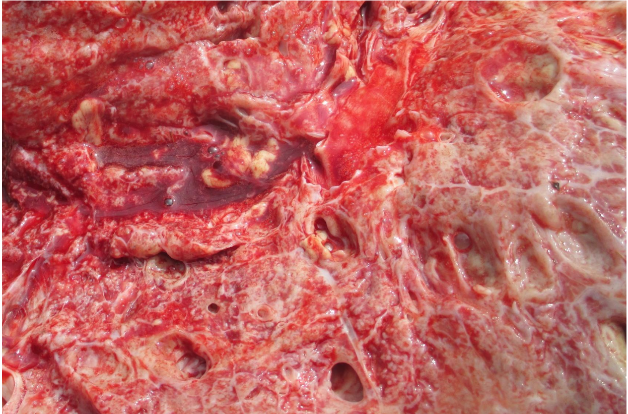
Technical Appendix Figure 2. Granulomatous tuberculosis lesion with caseous mass in lungs.