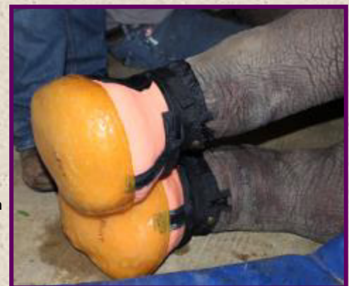
Coco's new boots!