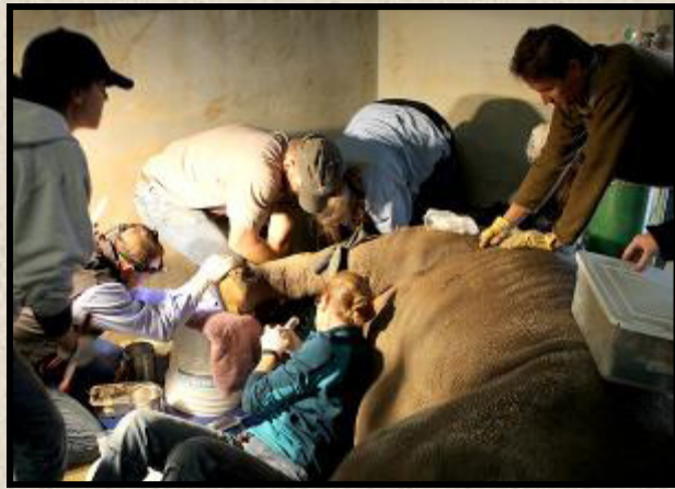
Fossil Rim staff and colleagues work diligently to complete the task at hand.