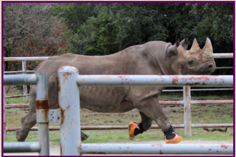
Minutes after receiving her Dicerus Boots, Coco takes them for a spin with a trot in her pen.