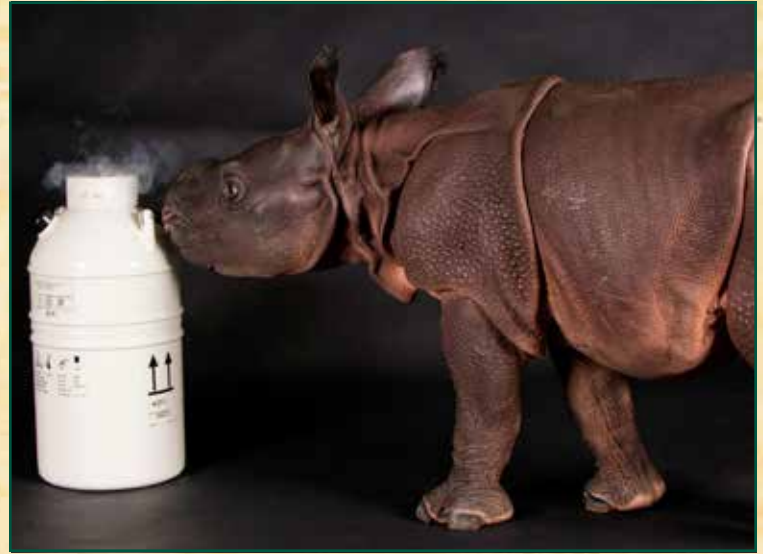
Buffalo Zoo AI calf with CREW's traveling CryoBioBank