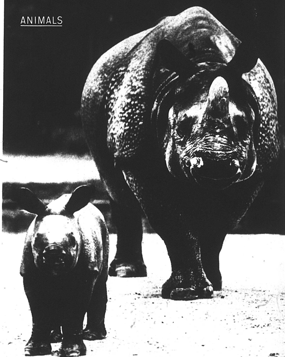
TWITCHING ITS TUFTED EARS, THE BABY RHINO LOOKS OUT FROM ITS PEN UNDER ITS MOTHER'S WATCHFUL EYE.