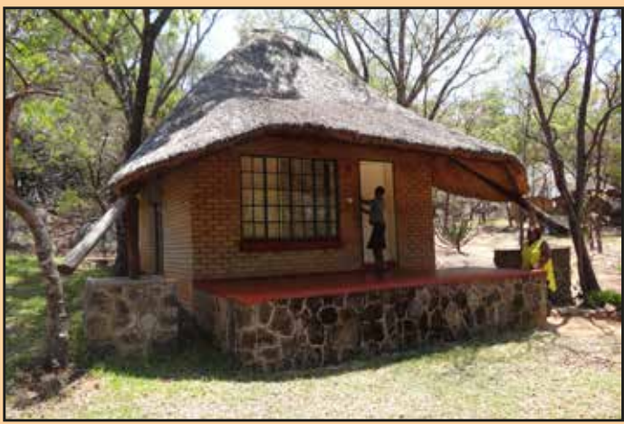
Sable Park Chalet