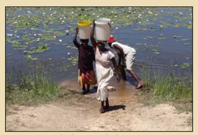
Rockvale women fetching water