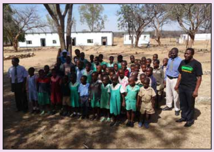
Sebakwe primary school.

The bricks are made by mixing mud with water which is then poured into homemade wooden moulds. They are then stacked in piles leaving an opening in the middle. Mud is then packed around the construction to retain heat, and fires are lit in the openings which are fuelled for some days to bake the bricks. The whole process is often set up next to a termite mound, where quality mud is readily available, prepared by the termites! The bricks are remarkably good and durable, and the roof construction of the buildings is often overhung to prevent water runoff from damaging the walls. The big cost is the cement required for the footings and the construction of the walls, and roofing materials, usually asbestos sheeting when not using traditional grass thatching.