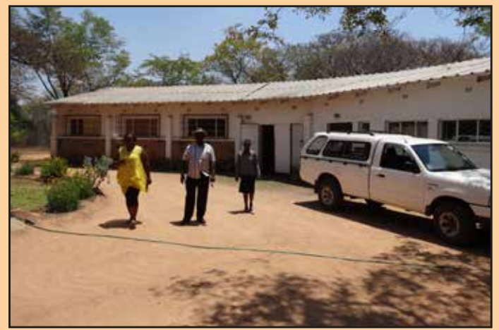
Sable Park KEEP project

WEZ is seeking new people to join as members and help carry on their mandate as well as raising funds for their projects and environmental education