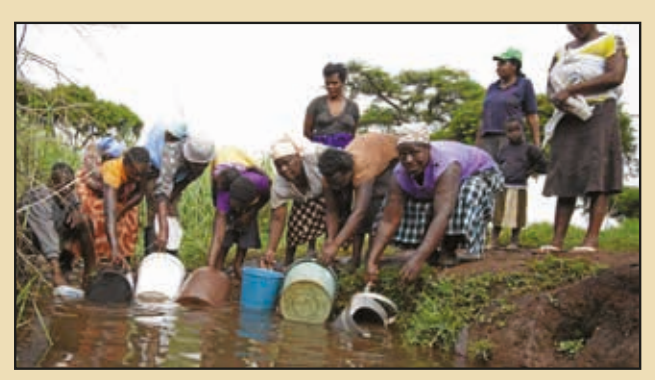
Women collecting drinking water in Harare