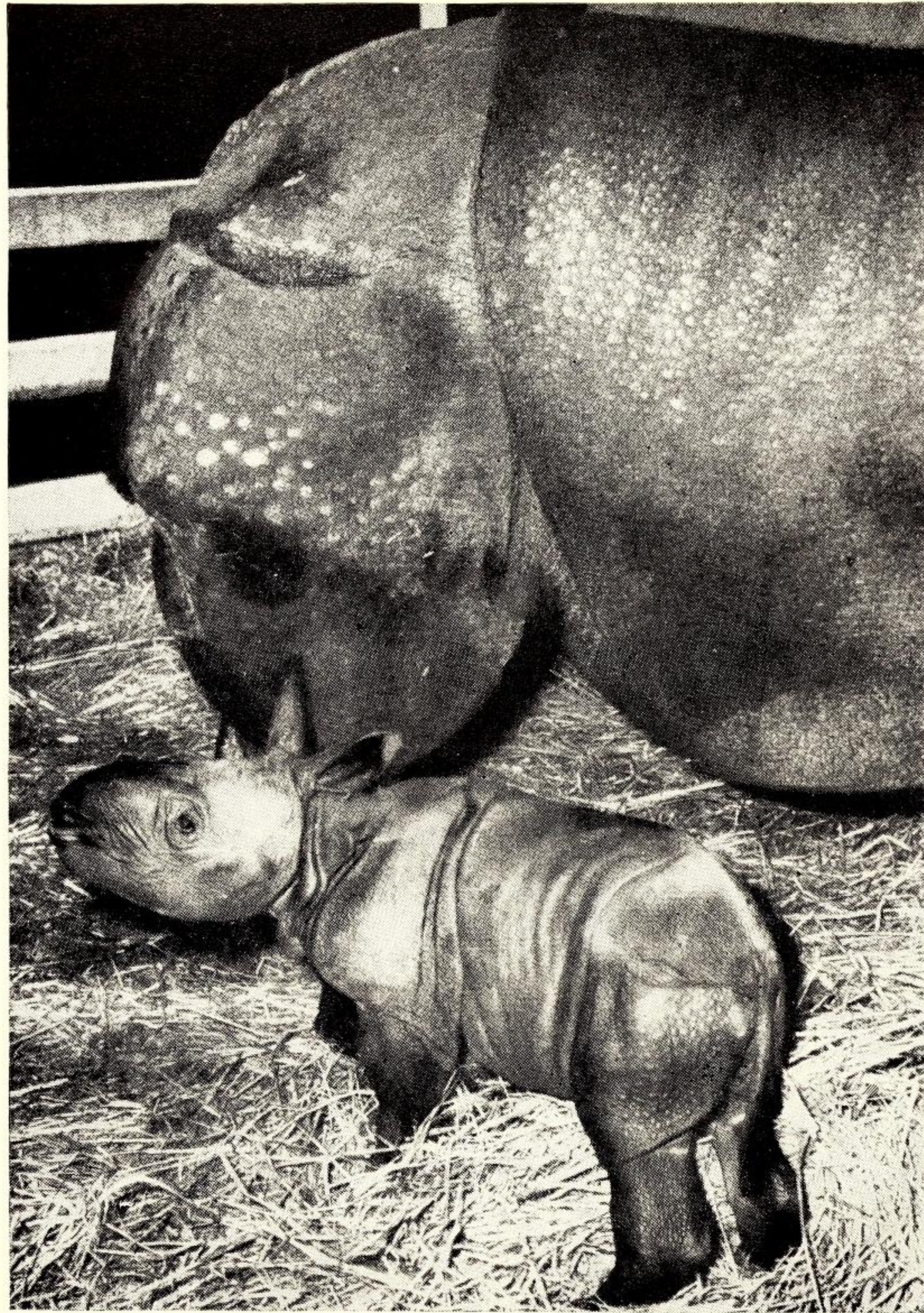
About two hours after birth. Basel Zoo.