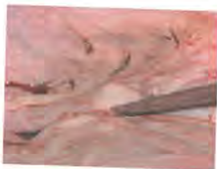
Fig. 3 + 4: Sonogram and post mortem preparation of uterine leiomyoma.

Ultrasound documented uterine pathologies regardless whether a female showed a regular oestrous or no cyclic activities at all, are independent from regular or missing oestrous cycle activities. The gravity of pathological changes stood in relation to the presumed number of lifetime non-conceptive cycles and to age. In contrast, females of advanced age which had one or a number of pregnancies showed remarkably few or no pathologies in their genital organs. In these females pregnancy and lactation seemed to have preserved the health and function of the reproductive organs. In the wild most females throughout their reproductive lifetime only have a small number of oestrous cycles. Considering inter-calving intervals of 4.5 to 6 years in the wild, pregnancy and lactation is the dominating endocrine event. In captivity pregnancy and lactation is a rather rare event.