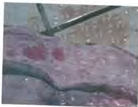
Fig. 1 + 2: Sonogram and post mortem preparation of endometrial cysts in the uterine horn.